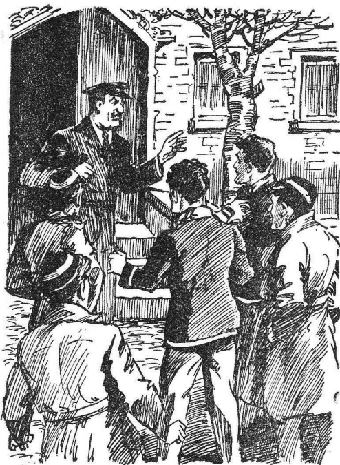
The Inspector talks to the Famous Five

"Hallo, hallo, hallo!" exclaimed Bob, suddenly. "Here's old Grimey again."