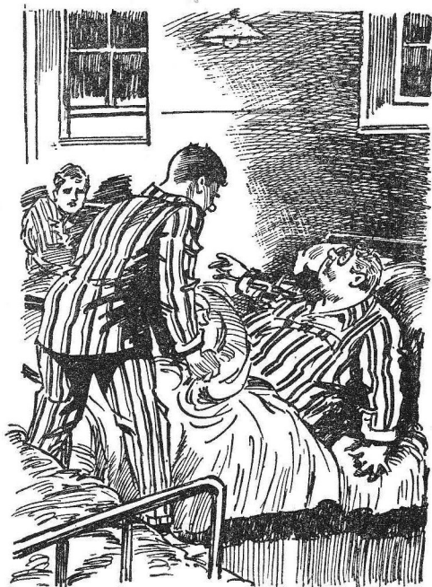
“Time!” said the Bounder’s voice