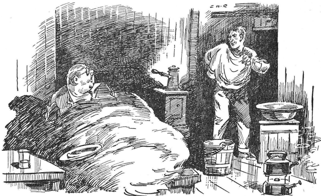
The fat junior sat up in the blankets

It seemed, to Billy Bunter, that he had been ages and ages a prisoner in that shabby, wretched caravan. But he was aware that this was only the second day of his imprisonment there. The hours seemed endlessly long—it was like a prolonged nightmare. Worse, if possible, was the anticipation of what was to come. How long was he to be kept there, a prisoner on short commons; tied up like a turkey when the brute was absent, scowled at or cuffed when he was at home? How was it going to end?