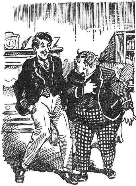
"Thanks," grinned Toddy