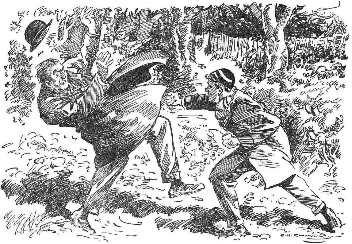
Fortunately for Smithy, the man's foot slipped