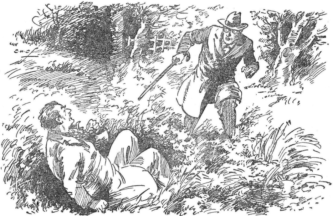
The Remove Master looked down at him

"The matter is now clear, Dexter," he said. "You will be detained, and handed over to the police, on a charge of kidnapping and robbery. You were in my study at midnight, on Thursday, when that foolish boy Bunter came down, and you kidnapped him to keep him silent. You were aware of the secret of that old well, which was discovered this afternoon by Vernon-Smith, a boy of