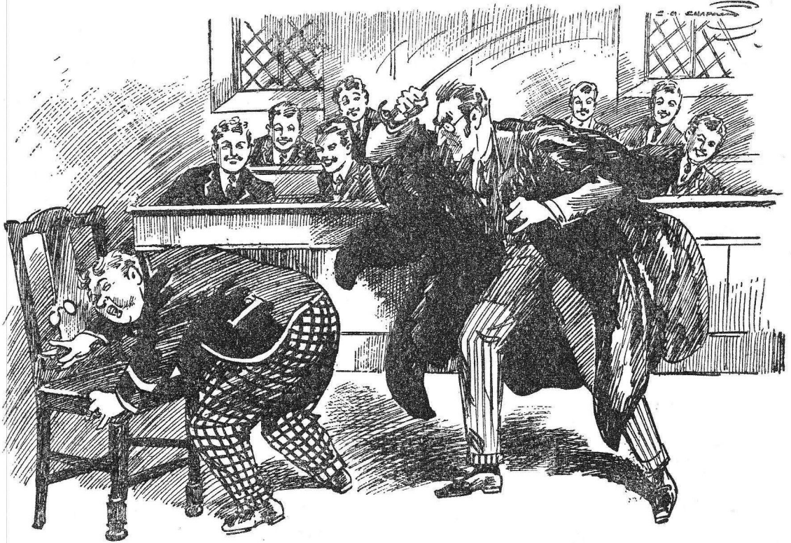
Dismally Bunter bent over