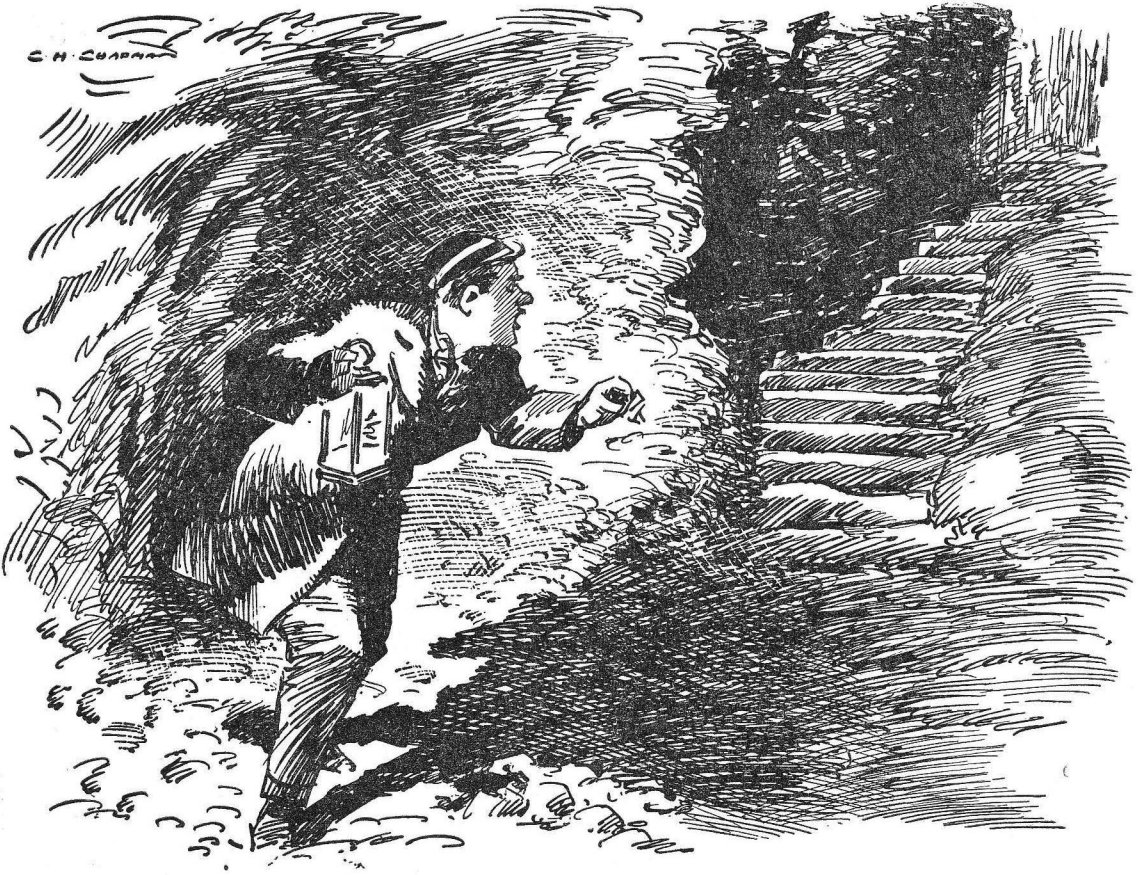
Smithy tramped up the steps, winding upward

The steps ended abruptly. He stood at the top, circling the light round him. To right and left were the walls of clammy stone. In front of him was what