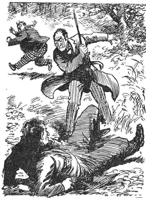
The Remove Master struck with his stick

The captain of the Remove had never put up such speed on the football field. He fairly flew across the little glade, his comrades at his heels. It was only then that James Dexter discovered that there were others on the scene. He discovered it, as he was grasped on all sides, and dragged away from Mr. Quelch, rolled over in the snow, and pinned to the earth in the grip of many hands.