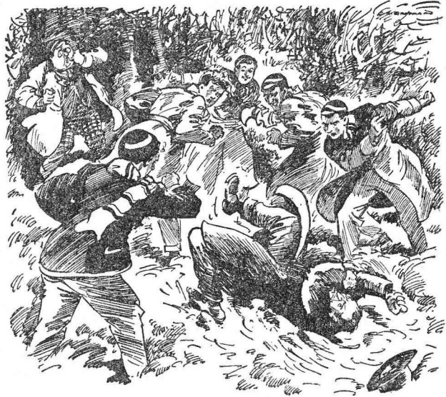
The angry caravanner . . . crashed headlong into the snow

It looked, for a moment, as if the enraged man would rush at them, hitting