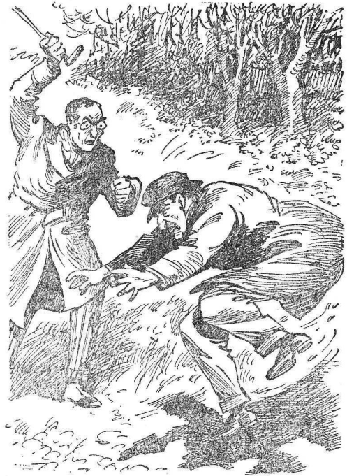
It came down . . . with a crash

Quelch looked like following him into the wood, for a few more swipes. But he checked himself: no doubt remembering that such a chase would not be in accordance with the dignity of a form-master of Greyfriars. He cast a gorgon-