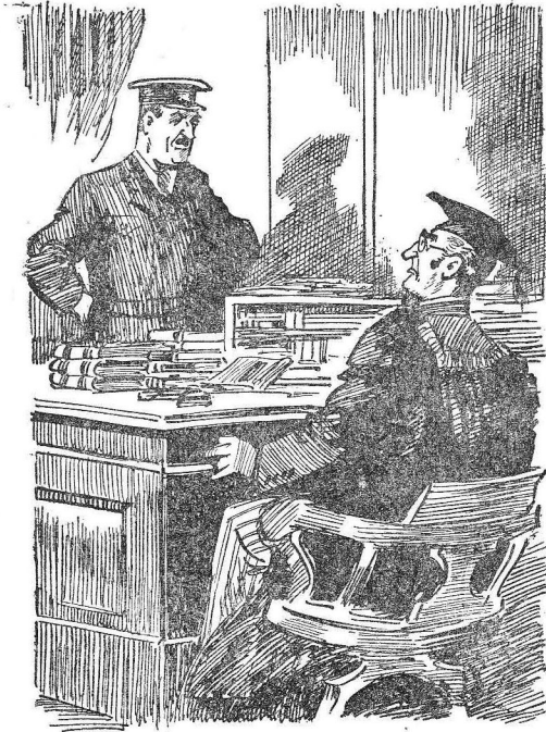
Inspector Grimes talks to Mr. Quelch

His only consolation was, that the missing junior must soon be found and brought back to the school. Whether the missing money