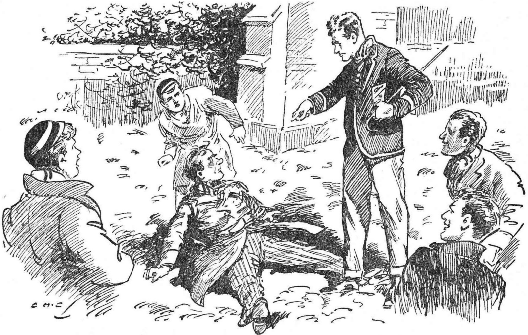
"Stop that!" rapped Wingate

"By gum!" said Bob Cherry, with a whistle. "So that's it! Same thing over again—but the Head's study this time."