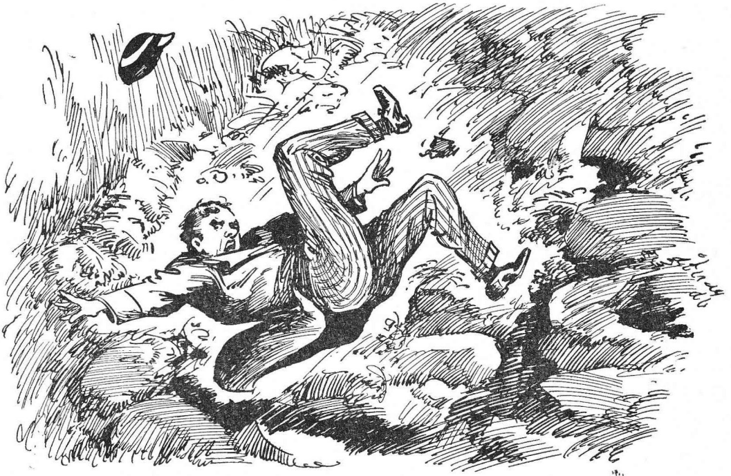
Smithy shot downward into darkness

The chill of the snow packed round him was already penetrating his overcoat. He had to get out of this, or freeze. He had to have help—but who was to hear a shout for help, in that lonely glade in the middle of a frosty wood? Only the man of the caravan, whom he had fled to escape!