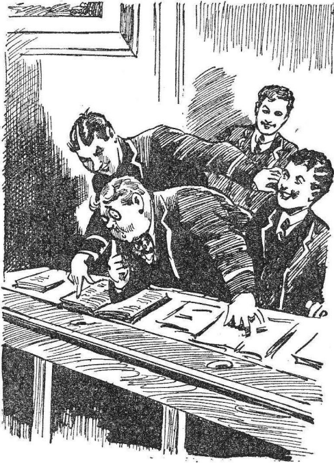
Vernon-Smith leaned over

"Oh, my hat!" murmured Bob Cherry, and there was a suppressed chuckle in the Remove. Bunter could always be relied upon for a "howler". This was one of his best.