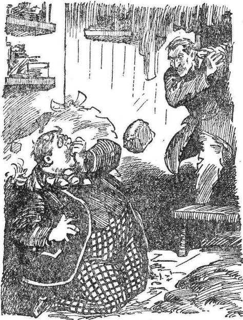
Dexter tossed Bunter half a loaf

When his meal was over, Dexter looked out at the door again. Then he turned scowling to Bunter, and threw him half a loaf.