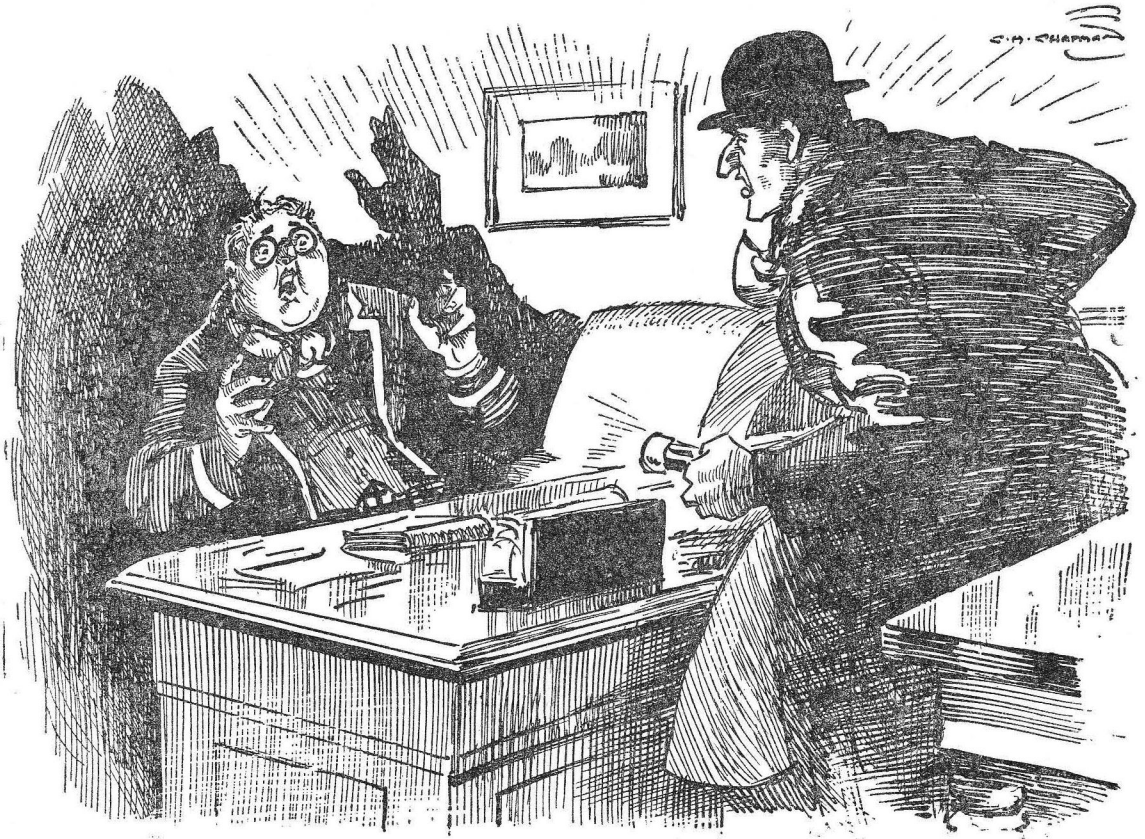
He made a single stride towards Billy Bunter

Billy Bunter opened his mouth for a yell. He did not care if Quelch caught him in his study, now: indeed, the sight of Quelch coming in would have been the gladdest sight he could have beheld. But he had no time to utter that yell. Strong hands grasped him, and a hand was clapped over his mouth. What happened next Billy Bunter did not know, for at that moment he fainted away from sheer terror.