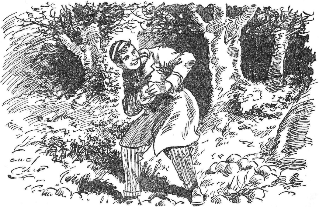
He had a good supply of ammunition

You put fellows backs up by putting down what happened in Quelch's study to Bunter, and you really asked for it—”