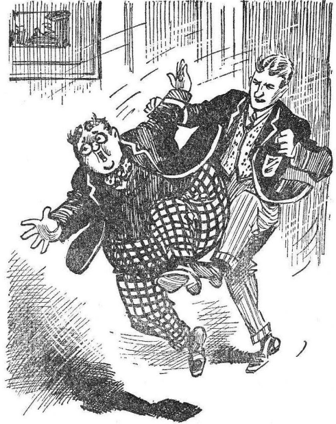
... After him rushed the Bounder, still booting

Billy Bunter disappeared round a corner. He left a crowd of fellows in the Rag laughing. But the hapless fat Owl was not feeling like laughing. The Bounder's foot had landed hard. And there was more to come! Somehow or other, the fat grub-raider of the Remove never expected to be called to account for his innumerable sins. But he was called to account now and the outlook was gloomy. No more frowsting in an armchair before the fire in the Rag, for Bunter, so long as Smithy was there. He had to steer very carefully clear of Smithy—unless and until he could restore the box of chocs pilfered from No. 4 Study! And that box was confiscated—in Quelch's study! Not for the first time in his fat career, Billy Bunter realized that the way of the transgressor was hard!