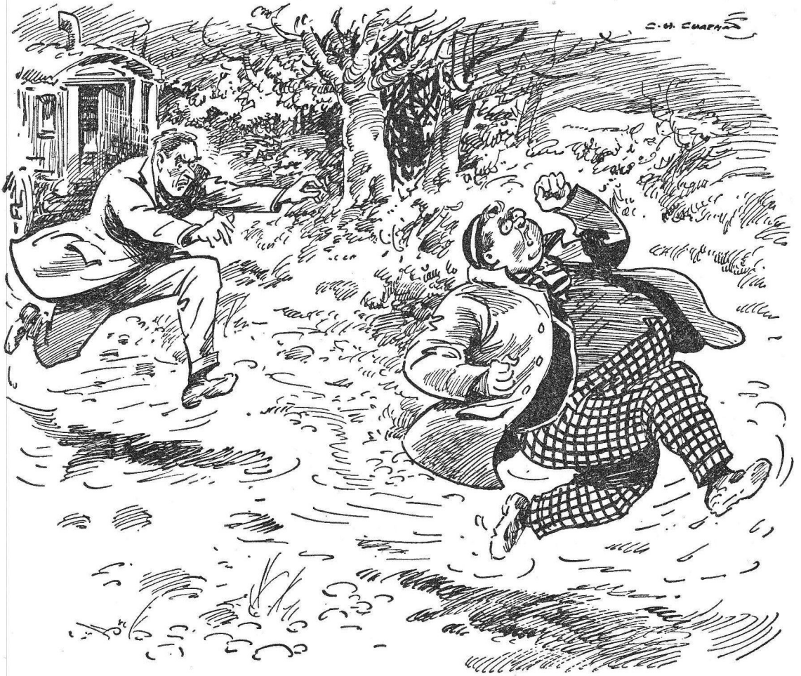
He charged after Bunter

not bear thinking of. Bunter bounded up and ran. He heard an angry roar behind him, which spurred him on. Seldom or never, in his fat career, had Billy Bunter put on such speed. For once, if for once only, Billy Bunter looked as if he would have quite a good chance for the School 100-yards. An angry caravanner, standing on one leg, holding a painful shin, glared after him from the van, as he vanished into the snowy distance. For some moments, he rubbed that painful shin. Then he leaped from the van, and charged after Bunter, and the expression on his face as he charged was positively ferocious.