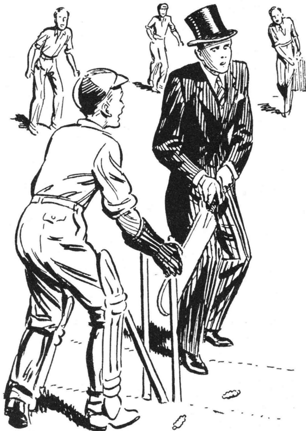
Denver fancied he was seeing visions

Felgate could hardly believe its eyes when Langdale — Langdale who had captained the First Eleven against the M.C.C. — went down to Dick Warren's bowling. Denver fancied for a moment that he was seeing visions, when Tom King caught him out first shot. Loring stared at the wicket from where the middle stump was missing, with unbelieving eyes. Such surprise occurred, and recurred, as the men in tail-coats and toppers sweated under the blazing sun, and the juniors, fresh as paint, gave them the time of their lives. It was hard for the Fourth to believe it when the Sixth were all down for forty-eight. But they were — and the Fourth, unexpectedly and almost miraculously, had won that match by six runs. Langdale and several other men kicked Denver afterwards. Denver took it