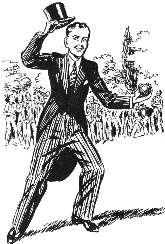
All Felgate yelled with merriment

Tom King won the toss and chose first knock. He opened the Fourth Form innings with Reece at the other end. Loring, the demon bowler of the Upper School, went on to bowl. The general expectation was that Loring would put up a double hat trick, and that