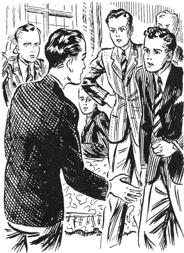
They could not believe that Langdale was serious

doubt that he would. Arthur Langdale was a man of his word. His word was his bond: and that bond had to be honoured, though the skies fell.