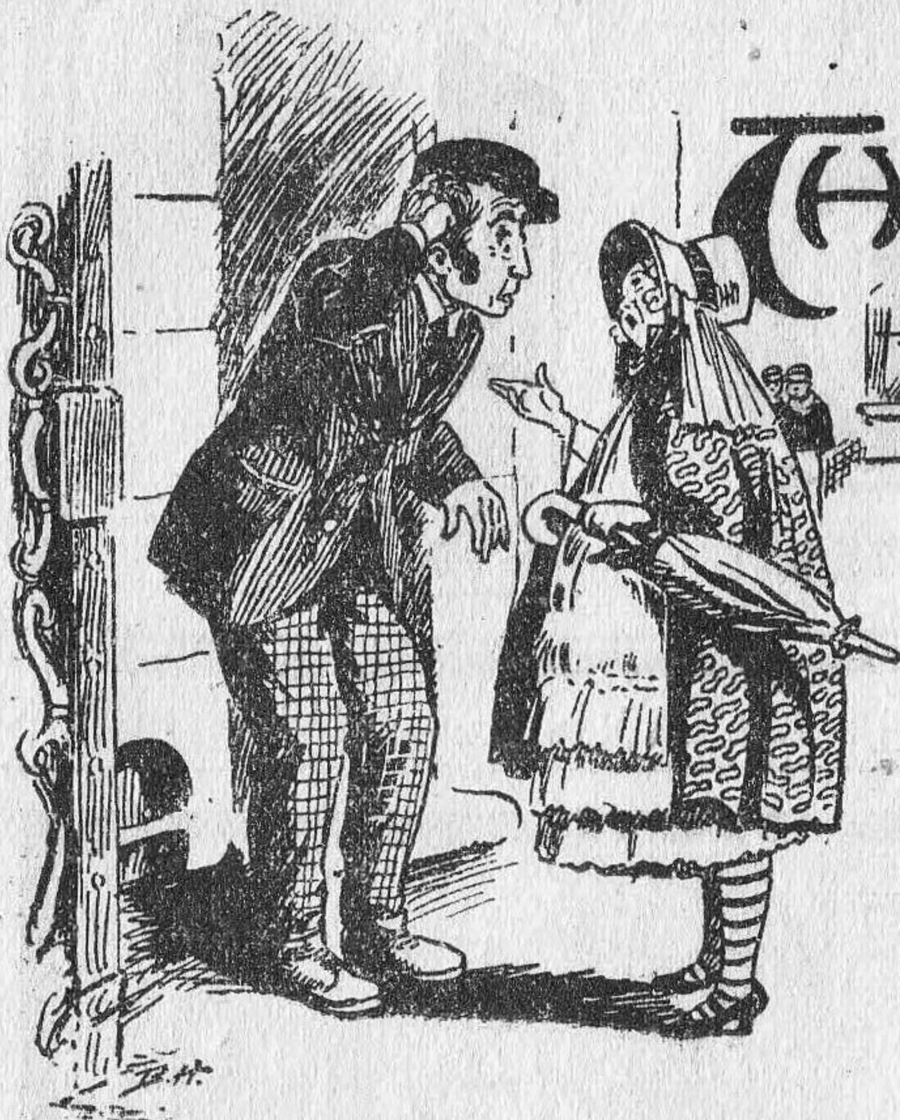
The 1st Chapter.