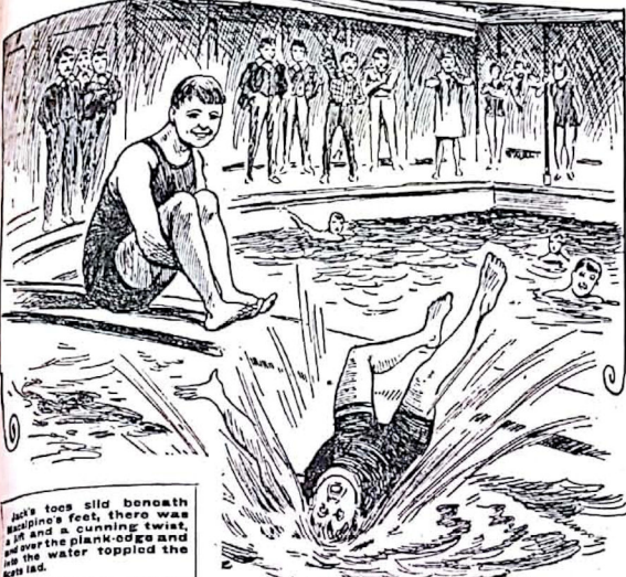
Jack's toes slid beneath Macpaine's feet, there was a cunning twist and the plank-edge and the water topped the boy's head.

A Rattling Complete Tale of Jack Noble & Co.