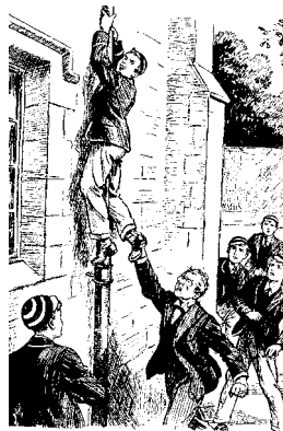
"COME DOWN AR ONCE !" HE SNAPPED

Mr. Twiss blinked at him through his rimless pince-nez.