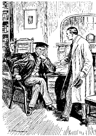
DR. LOCKE BLINKED AT HIM

“I have made the most careful and meticulous examination, sir, of the window, the sill outside, and the grass below the sill. The result is the assurance that no one either entered or left the house by that window last night.”