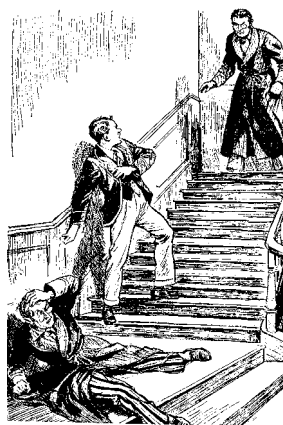
FOR A LONG MOMENT, MR. QUELCH STARED AT THE BOUNDER

not sleep, and I—I was going down for a book I left in Common-Room, and—and all of a sudden I felt somebody behind me— Oh, goodness gracious! I—I—I was so startled—oooogh!”