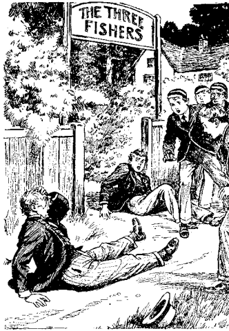
THE FAMOUS FIVE STARED AT THE SPRAWLING MAN

The Famous Five stared at the sprawling man, in dismay, almost in horror. It was little Mr. Twiss, the Head's new secretary. Not for a moment had they thought of Mr. Twiss, or remembered his existence. And there he was— sprawling at their feet, knocked over and winded by Bob as he charged out of the gateway. It did not occur to them, for the moment, that it was an odd circumstance that the Head's secretary had been coming in at the gate of that disreputable inn. They were "spotted" out of bounds by someone belonging to Greyfriars: and they could hardly expect Mr. Twiss to keep silent on the subject.