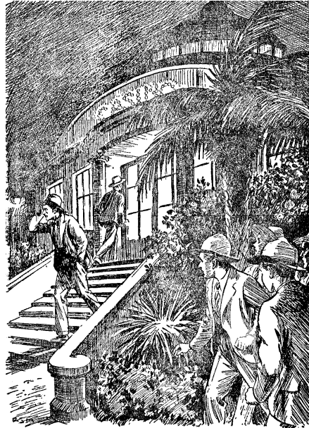
He moved with an uncertain step, almost like a drunken man

“No need to say anything,” said Harry Wharton. “Let’s get back to the boat. I suppose he’s going back now.”