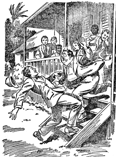
Bunter did not even see him till he crashed

Bunter fled for his fat life, dodging among the long cane chairs dotted about the spacious verandah, with an avenging foot in close pursuit.