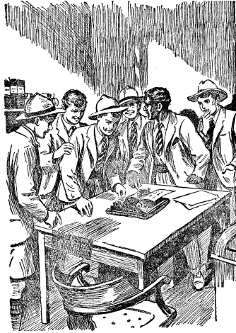
Six fellows made remarks, all at once, as they looked

But he was likely to experience a little difficulty with that message, if he found it. Indeed, it was doubtful whether he would recognise his own name at the first glance, Bunter having spelt it by ear, as it were, which would have appeared strange enough to eyes accustomed to the Portuguese spelling.