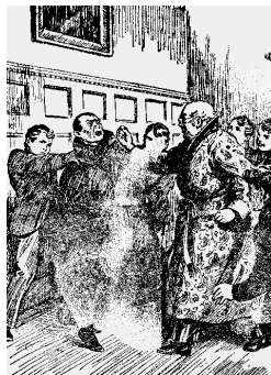
HE SHOOK A PLUMP FIST UNDER BROWN'S NOSE, CAUSING HIM TO JERK HIS HEAD BACK