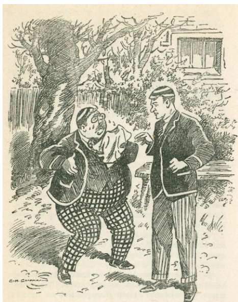
'A REMOVE MAN BLUBBING - BY GAD'

'Quelch whopped you, or what? Rats! Go and yowl somewhere else— you make me sick. A Remove man blubbing— by gad!'