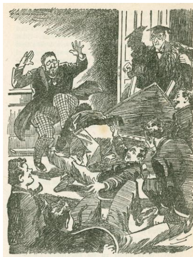
THE EASEL WENT UP, BUT IT CRASHED AGAIN

In the midst of the uproar, the door opened. No one, in the excitement of the moment, noticed it. For a second, an angular figure stood unnoticed in the doorway, and a pair of gimlet-eyes gleamed at a scene of wild disorder. Then a voice with a razor-like edge on it cut through the din.