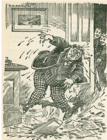
BUNTER'S IMPOSITION SCATTERED ON THE FLOOR, IN A SEA OF INK