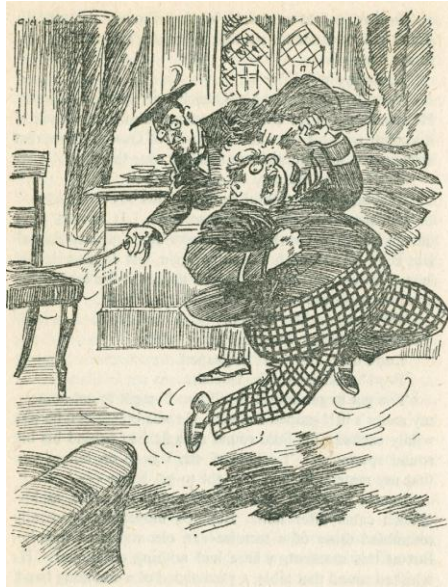
HE LEAPED AWAY: AND THE CANE CAME DOWN ON THE SEAT OF THE CHAIR, WITH A RESOUNDING CRACK

He broke off again and whisked once more, as Quelch came round the table. Twice the Remove master, and the fattest member of the Remove, circumnavigated the study table— Bunter still ahead.