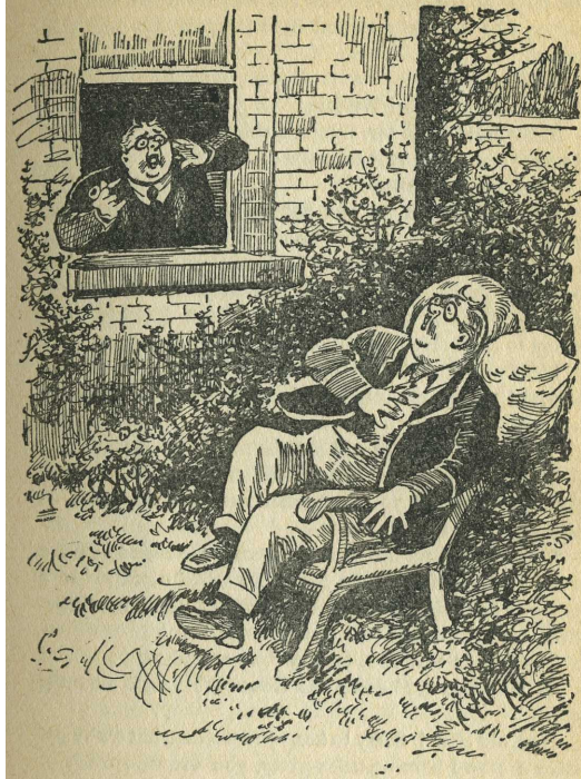
'WILLIAM!' BUNTER DECIDED TO BE DEAF

The back of the garden-chair hid him from the window. Bunter, like that sage animal Brer Fox, lay low and said 'nuffin'.