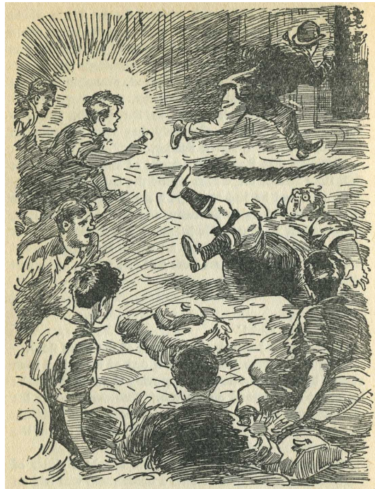
THAT FIGURE WAS MAKING FOR THE DOOR

'Yaroo! Leggo! I say, you fellows, help!' yelled Bunter, frantically, and, hardly knowing what he was doing, he kicked out at the unseen grasper.