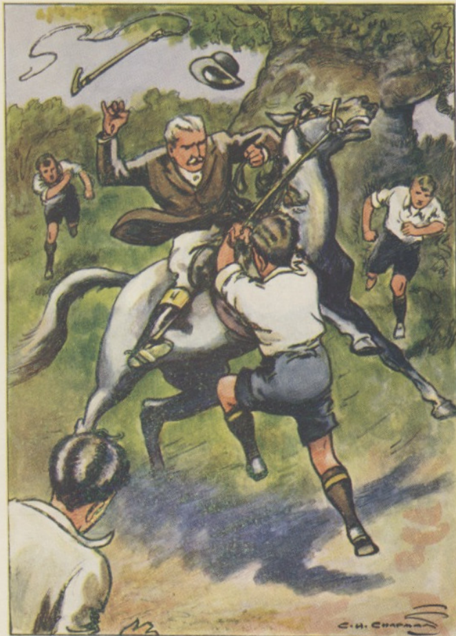
BOB FLUNG HIMSELF AT THE RUNAWAY'S HEAD