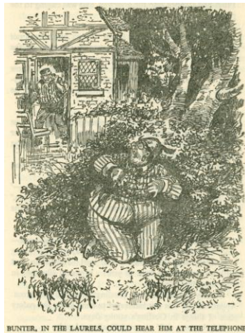
BUNTER, IN THE LAURELS, COULD HEAR HIM AT THE TELEPHONE.

But Prout, evidently, had no idea that he was there.