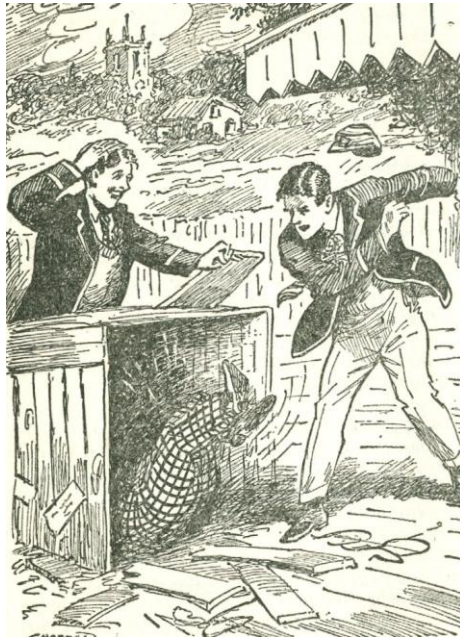
HALF OF HIM WAS INSIDE THE CRATE

'We'll assist you with the rest. Don't say we never help Greyfriars. Help me tilt this case the right way, Monson.' As Monson did so, the Owl slithered down the rest of the way. It was a tight fit sideways, but the top of the Owl's head was below the top edge.