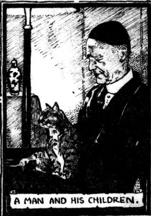
A MAN AND HIS CHILDREN.