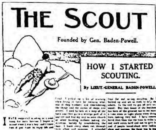
Portion of Inside Front Page, The Scout No. 1, April 18th, 1908