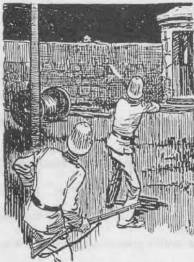
The escaping Martinel was just about to slide down the further side of the wall, when he heard a rifle crash.