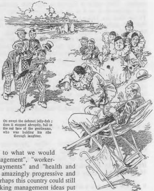
On swept the defunct jelly-fish; then it stopped abruptly, full in the red face of the gentleman, who was holding his ribs through laughter.