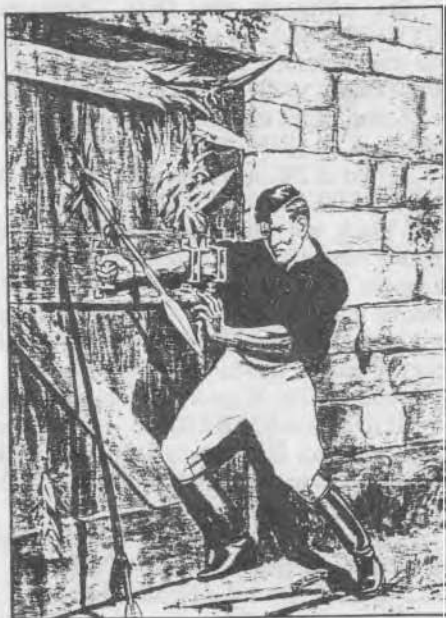
His Last Hope