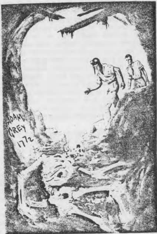
"We've come a bit late to help this poor blighter. . . ."

"Why pretend? Let us face our end with the cold calm philosophy of our race, as they say in books," he added sarcastically. "Frankly, if they take us to that crocodile pool I shall scream my head off ..."