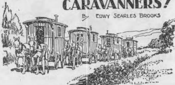
(Told by NIPPER of the Remove.)

Timothy Tucker, Fatty Little, the Trotwood twins and Archie Glenthorne as examples. Church says Clarence can't help being "as tall as a lamp post and thin as a rake" and anyway, one doesn't choose his own school - he's sent there. Clarence turns out to be a very enthusiastic caravanner and eager to do his bit helping with the horses and the cooking and all those jobs that have to be done by amateurs when they come into contact with camp life. And the rhymed dialogue continuously keeps the rest of them amused.