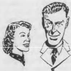
Left: Professor Peabody and Dan Dare in 1950s Eagle .