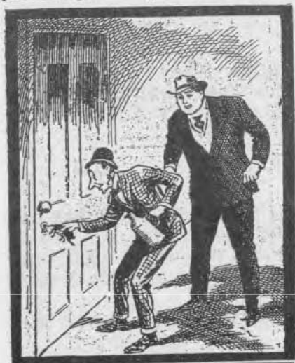
"All right, Nibbles," cried Tim, "I'm not going to hurt you. I'm only going to make you get me out of another difficulty."

In 'The Seabright Affair' a suspect posts a letter which Swift thinks contains useful information regarding a criminal gang's whereabouts. With no obvious way of retrieving the letter Smailes tells Nibbles, "I want you to pop inside the letter box and fetch the letter wot's inside ... it's the only one there". Smailes wonders if the mouse will understand, but remembers that while they were in jail he taught it to run after and fetch bits of oakum. In no time Nibbles comes up trumps and reappears with the letter in his mouth. Swift's assumption is correct and the letter leads them to the gang's hideout.