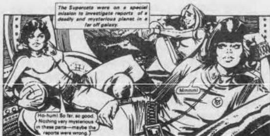
The Supercats – girl astronauts from Spellbound , 1976.