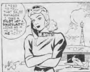
Flavin' Jenny, the picture-strip heroine in the Amelia Earhart mould.