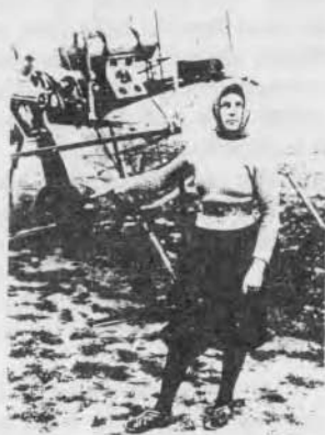
Hilda Hewlett, the first British woman to acquire a pilot's certificate, in 1911.