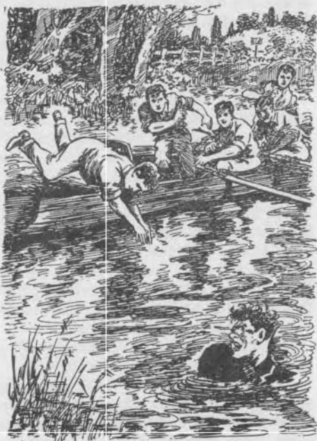
BOB CHERRY PUT HIS HANDS TOGETHER AND SHOT INTO THE RIVER

An illustration from BILLY BUNTER AFLOAT