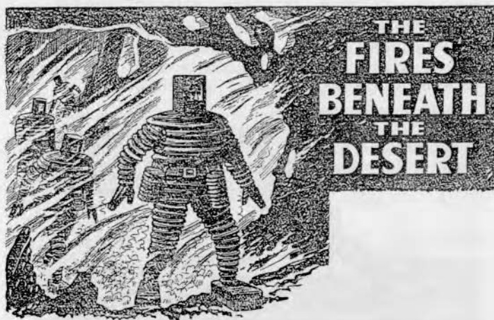
The pillared cavern where the one-horned fury lives.

Certainly, in 1944 few of us in Britain were aware of California's constant peril from natural "time bombs" like the San Andreas Fault. But the attraction for me was the series of hair-raising adventures experienced by the four explorers. Clad in suits of asbestos and steel when flames threaten, they successfully carry their loads of "nitrogenulene" through an amazing variety of deadly dangers to its place for explosion. "They had reached regions of fire, had discovered fabulous monsters and strange races of men, underground oceans, jungles and many other marvels" before they could return to the cave system in the desert from which they had set out.