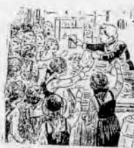
A Busy Scene in the Tuck-shop