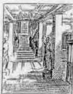
A view of the Entrance Hall