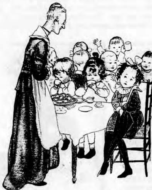
Amelianne and the Green Umbrella (1920)