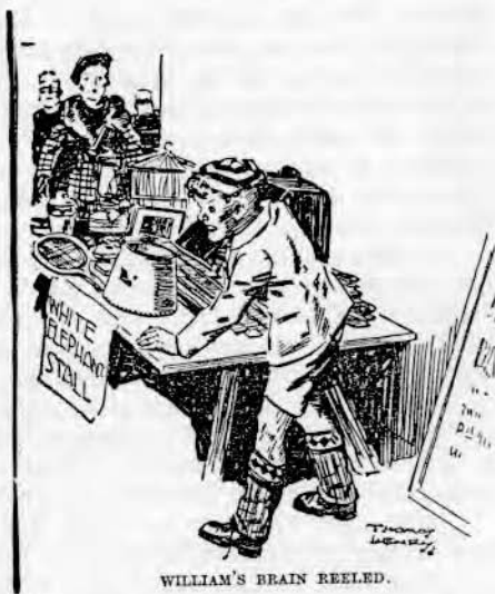
WILLIAM'S BRAIN REELED.

If Great Aunt Sarah's hearing was impaired, her eyesight wasn't. She seized the ear trumpet and proceeded to wreak her vengeance on Hubert. She felt a great deal better after that, when her gaze found William, who was more subdued than ever. The Vicar's wife had just told him what The Whistler really was. Great Aunt Sarah misread William's expression as virtue --- such a nice honest looking boy. Impulsively she gave him sixpence.