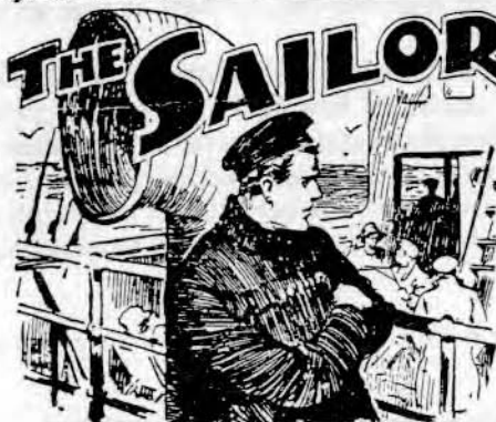
The Missing Stamp Collection.

I T was an hour after midnight, and the Border Queen was steaming through the still waters of the Red Sea.