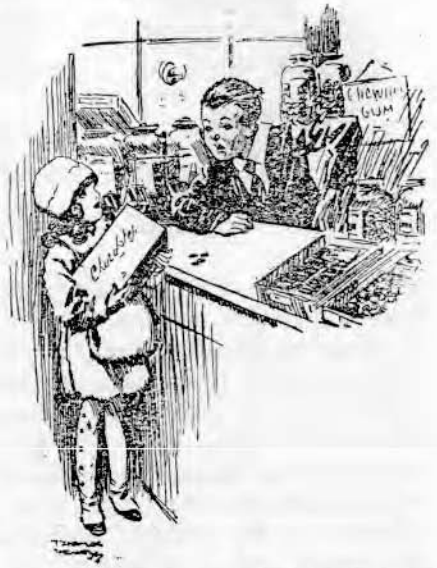
"MONEY DON'T MATTER," SAID WILLIAM. "THINGS IS CHEAP TO-DAY. AWFUL CHEAP!"