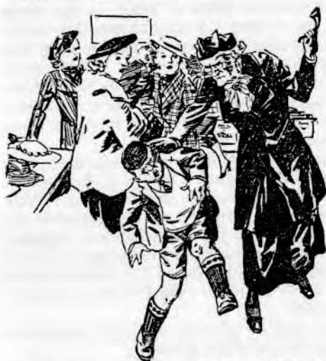
SHE TURNED TO HUBERT, AND BOXED HIS EARS WITH SURPRISING VIGOUR.

Meanwhile, William and the Outlaws, hoping to raise a spot of cash from their nefarious New Year Resolution, decided to try to sell it at the White Elephant Stall during the Jumble Sale next day. Mrs. Brown was dubious at first of her son's offer of help --- she had memories of so many previous occasions when William had helped --- but she was quite touched at the way he stood quietly behind the stall. And then Mrs. Lane arrived with Hubert and Great Aunt Sarah.