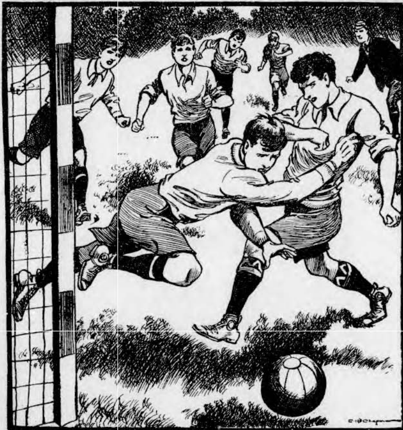
BULSTRODE'S HEROIC SAVE IN THE GREAT FOOTBALL MATCH!