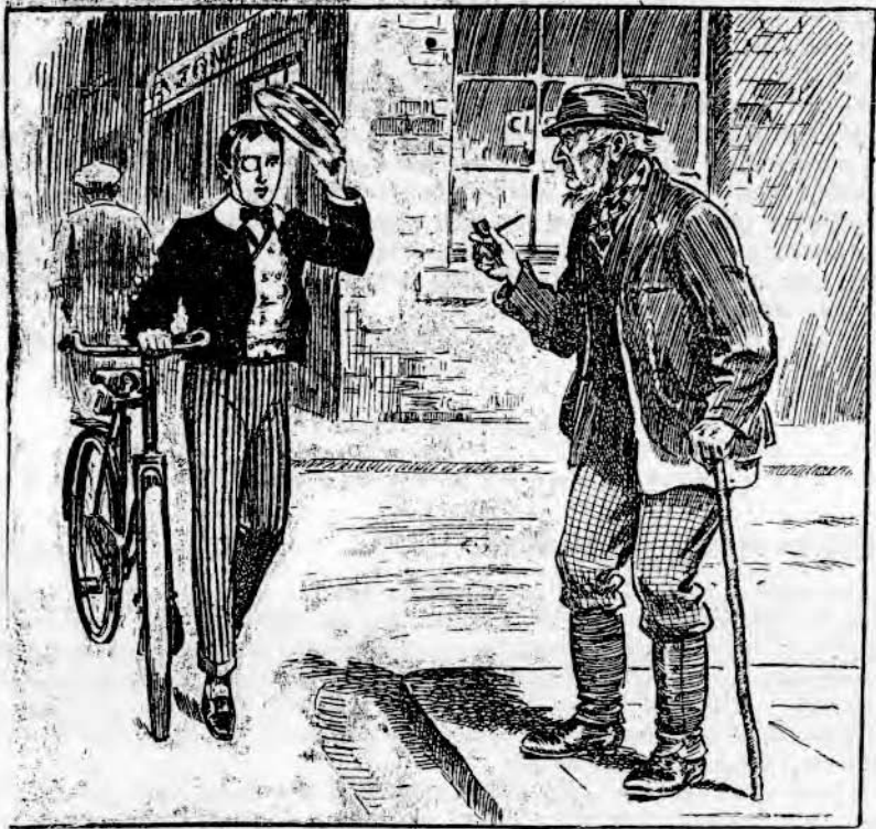
Arthur Augustus halted to address a ruddy-complexioned native who was smoking his pipe in the square. "Pway excise me," he said politely. "Are there any shops open in Aylesbury?"

Then in Magnet, No. 1120, August 3rd 1929, Harry Wharton & Co are in Bucks with Bob Cherry's ghastly old motorbike called 'Methuselah'. Chapter 3 begins, "Bucks is a beautiful Country". In this story, Harry Wharton & Co meet up with Coker & Co in a (fictitious) village called Greenleaf [although there is a village called Whiteleaf in Bucks]. In Greenleaf, Coker ends up in a huge box of eggs outside the village store.