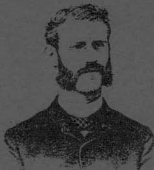
Edward Stratemeyer in 1891

This portrait accompanied the installments of "Jack the lawyer of The Trials and Triumphs of a Young Merchant" which appeared in The Mailer , April 25 to June 3, 1891. Editor: Edward S. Ellis. The serial was published in its entirety in Good News , January 23 April 2, 1892.