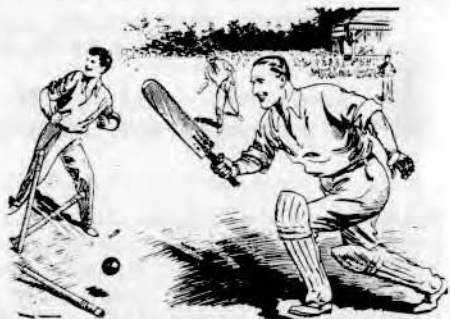
Frank Richards and Martin Clifford were now together, and batted very steadily until Frank Richards was smartly run out!

Consequently, the light-weight West and Watson would have to make way for better men. So, in my opinion, would Handforth. Like Hazeldene and Cardew, Handforth was undependable. His hot-headed behaviour at River House on one notorious occasion cost St. Frank's not only the match, but a lengthy ban on the