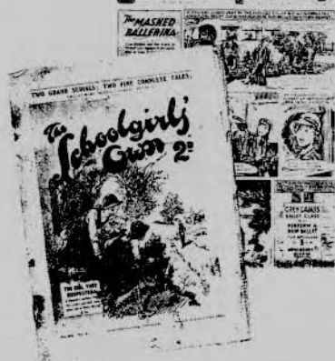
The durable tradition of schoolgirl adventure: The Schoolgirls' Own (13 June 1925) and School Friend (the second magazine so named, 11 August 1956).

SEVEN PICTURE-STORIES · FOUR STORIES TO READ · INSIDE! SCHOOL FRIEND