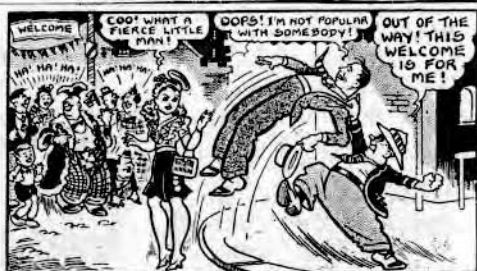
2. Now we'll let you into a secret! The welcome was not for George, but for Professor Chizzler, one of the lads of the village who had spent twenty years or so in Egypt, pottering about looking for old china. That's Prof. Chizzler peeping out from under the sun-hat. Having lived on curry for so long he was a gent with a rather hot temper.

The more one studies Film Fun from a sociological point of view the more one can appreciate how clever the Editor was in giving the readers exactly what they wanted to see and read. The thirties brought the depression with unemployment, poverty, food shortages and so on, so the strips then would mainly depict masses of food in the shape of huge feeds given as rewards for our favourite stars' good deeds. Huge piles of sausages and mash, with the former sticking out of the top. Slap up dinners at the Hotel de Posh or Cafe de Ritz, with huge jellies, large iced cakes and the company of pretty, shapely girls. The