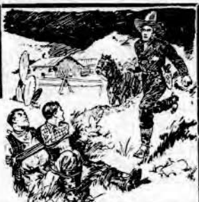
Bill raced across to the two men.

Cinema, papers that are so collectable today. It was in the late thirties when Film Fun reached its peak. One week when they gave away a George Formby song book its circulation reached a staggering 850,000 copies. This equalled D.C. Thomson's best-selling boys weekly 'The Wizard' as well as that of the rival department at Fleetway House, the pink covered 'Chips' featuring Weary Willie and Tired Tim.