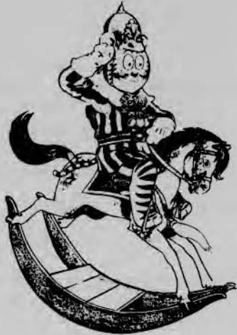
The bouncy Tiger Tim, from the cover of his 1927 annual.