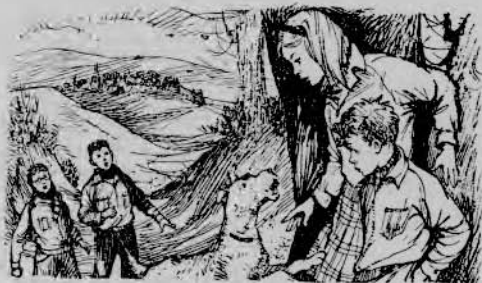
Four children in Sussex, an illustration by Lilian Buchanan to Malcolm Saville's Four-and-Twenty Blackbirds (1959).