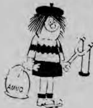
Bad Penny, an anti-heroine invented in 1966 by Leo Baxendale for Smash!