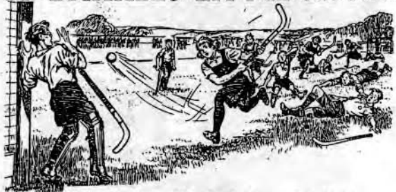
From Hotspur 596, 13th December 1947.