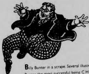
Billy Bunter in a scrape. Several illustrators depicted Bunter, the most successful being C.H. Chapman. This is from one of his cover designs for Billy Bunter's Own.

SEVEN PICTURE-STORIES · FOUR STORIES TO READ · INSIDE! SCHOOL FRIEND