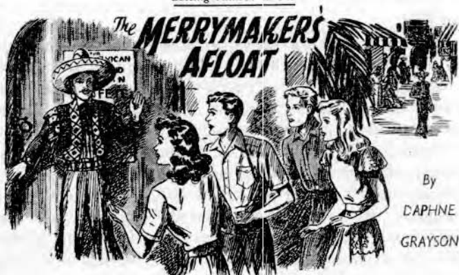
From Girls' Crystal no. 613, 19 July 1947

New York to Australia) the ship was to call at several ports to pick up students from Mexico, the West Indies and from all over South America. They visited a small Brazilian town called Pae Cortella ("The Merry-makers in Brazil", G/C 1947). Once the ship was ready all the students rejoined the Ocean Star in "The Merry-makers Afloat" (2) ( G/C 1947-48).