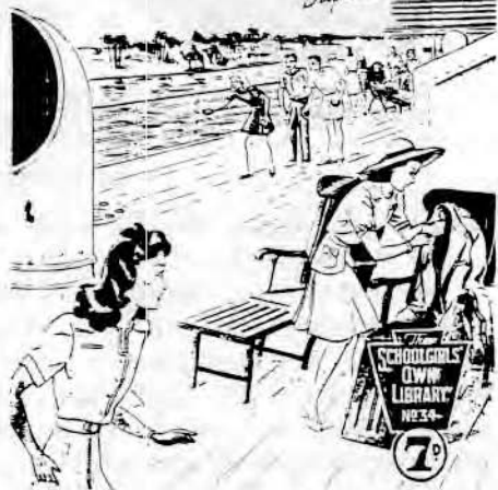
Girls' Crystal no. 188 (27 May 1939)