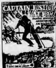
CAPTAIN JUSTICE AT BAY B.F.L. No. 570 APRIL 1927 THE ROCKETEERS MAY 1926