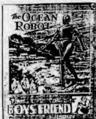
THE OCEAN ROBOT B.F.L. No. 629