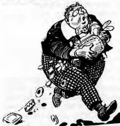
William George Bunter

(Copies can be ordered from Roehampton Institute, Digby Stuart College, Roehampton Lane, London SW15 5PH at £10.00 which includes postage. Cheques should be made out to Roehampton Institute.)