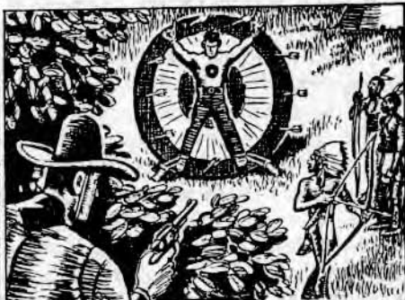
2—Leatherface was soon on the trail of the Redskins. After two hours' hard riding a spiral of smoke ahead told him he was nearing the Kiowa camp. He tied Raker, his horse, to a tree and crawled forward, drawing one of his guns. His trigger finger tightened as he peered from behind a bush into the camp. Only a few yards away from him was a giant target with a white man tied to it, spreadeagled.