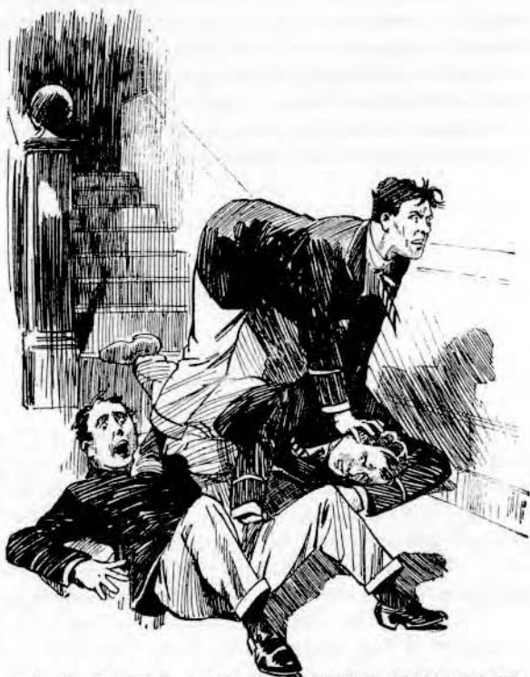
"You fatheads, getting in a fellow's way!" roared Coker. "Don't stop me—I'm in a hurry!" As Coker scrambled up, he planted a foot on Gwynne's neck, and rested a heavy hand on Wingate's face. But Horace was not in a mood to notice these trifles.

On many occasions Horace Coker has sought to demonstrate his 'short way with fags' and, sadly for him, as many times has the unexpected (for him) occurred. History merely repeats itself. Every graspable part of his burly person would be duly seized and a dishevelled, heaving figure would be borne aloft and conveyed with thrashing limbs to the brink of – for example – the ditch alongside Friardale Lane or an oozy patch on the banks of the Sark. It would be a murky ditch sadly in need of clearing of a multitude of brambles, sharply stinging nettles, and sundry other thorny specimens which hide from view a far from salubrious residue of mud, the stirring of which would create a frightful atmosphere.