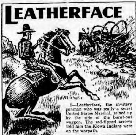
1—Leatherface, the mystery gunman who was really a secret United States Marshal, reined up by the side of the burnt-out wagon. The red-tipped arrows told him the Kiowa Indians were on the warpath.