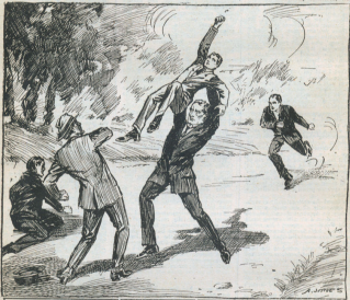
Spearling lay upon the ground, knocked there by a savage blow; Blake was in full pursuit. A desperado at bay, Carfax lifted the nimble form of Tinker high above his head and held him there, ready to hurl him at Vincent Trebourn.

"Followed Pendleton here from London, sir," Steel said, waiting. "He stopped to buy provisions on arrival here, which made me think I was on the right track; then he went straight to a cottage in May Tree Lane. The windows of a room at the back are all closely shuttered, which