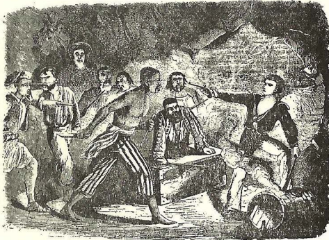
"WELL, YOU KNOW," SPOKE THE OLD MAN.