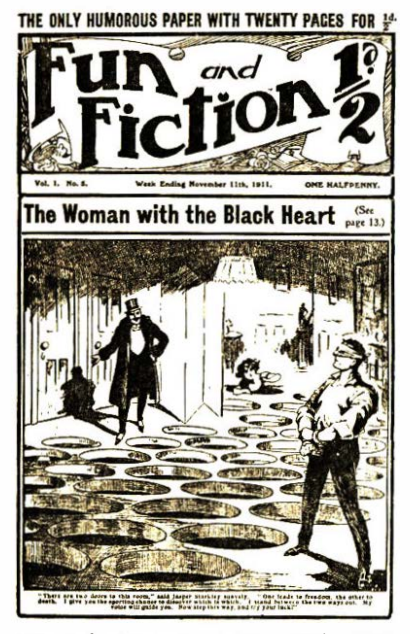
Fun and Fiction No. 5, Nov. 11th, 1911

detective gaze into a crystal ball and describe what he saw therein, while a client anxiously waited.