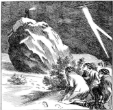
FROM THE ILLUSTRATIONS BY HENRY JONES, TOPIC BOOKS, "THE GREAT SPORTS TOURNAMENT."

Henry Jones, the well-known artist, has illustrated the "The Great Sports Tournament" in a series of 12 volumes, which are published by Topic Books. The illustrations are of a high standard of art, and the text is of a high standard of interest and information. The series is a valuable addition to any library.