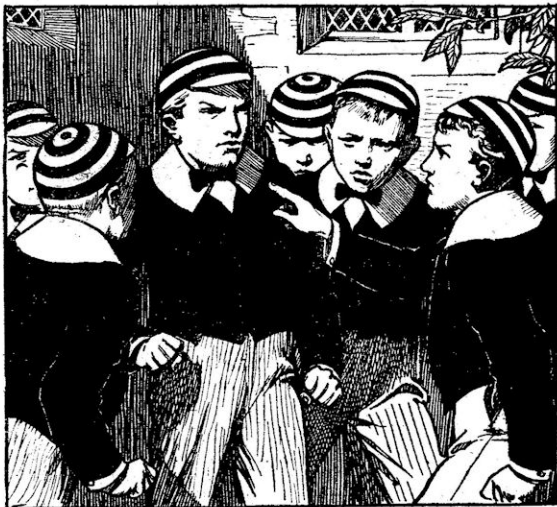
The fags surrounded Cardew. (See Chapter 5.)

look. It was little more than an hour since he had caned D'Arcy and turned him out of his study. "You are a good boy. Here is ze letair. You will be careful of zat letair, D'Arcy, because there is money in him."