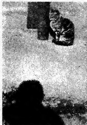
"Record Breaker," of Manchester. He's the shadow, of course, not the cat!

ANSWER: Not all in one afternoon, I hope? That reminds me. I was nearly run into by a bicycle myself this morning.