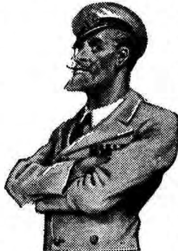
Meet Captain Justice today—in

Meet Captain Justice, the Gentleman-Adventurer, whose exploits have earned him world-wide fame. He's off on the adventure trail again, and week by week his exploits are to be recorded in MODERN BOY. Join up with him and share his perils and amazing discoveries. The first story, entitled "City of Secrets," appears today in