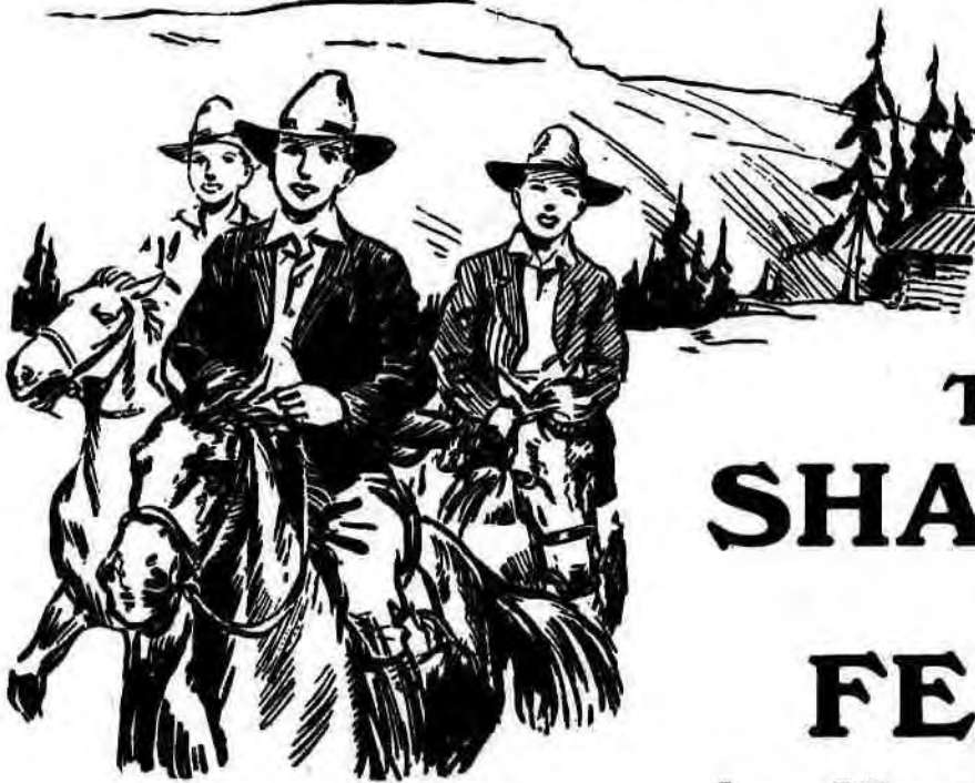
The Last Day at School!

YOU'LL ENJOY EVERY WORD OF THIS GREAT YARN OF THE CEDAR CREEK CHUMS— TELLING OF BEAUCLERC'S DESPERATE DASH TO SAVE HIS FATHER FROM HIMSELF!