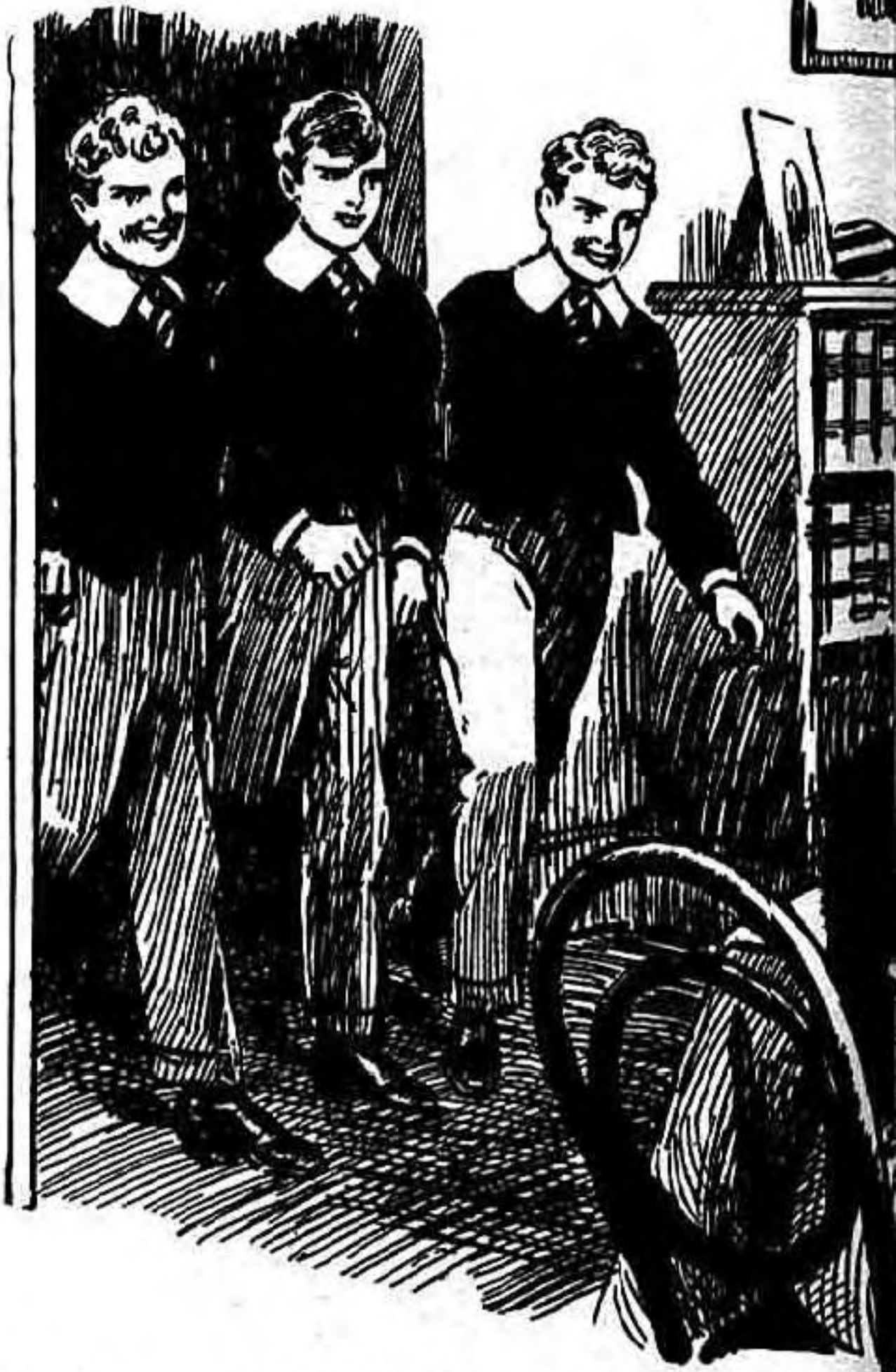
The door opened and Wally D'Arcy and Levison minor man- announced Wally. "Take him away and bury him!" Levi-

Clampe of the Shell came out of the ranks of