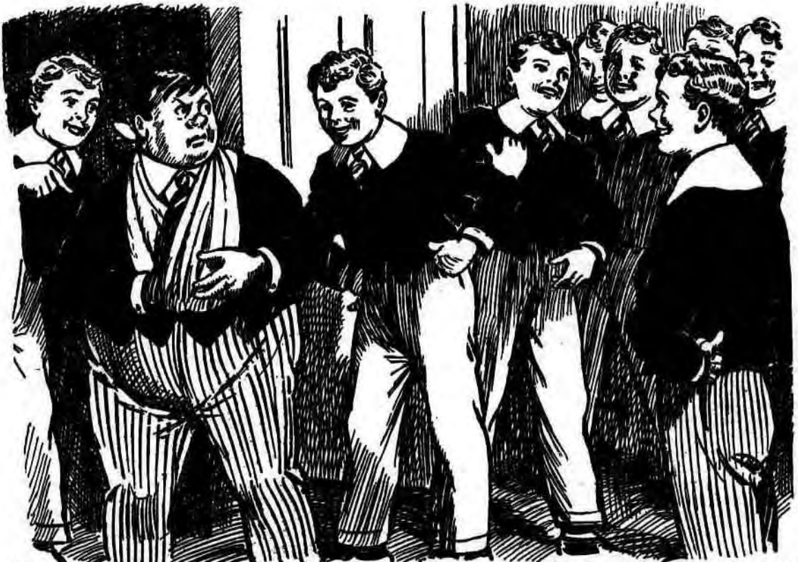
"Behold the gallant hero, you fellows!" said Monty Lowther. Baggy Trimble was the cynosure of all eyes. His statement that he had hurt his hand was a warning that he was going to claim to be the fellow who had rescued Mr. Brown's little daughter!