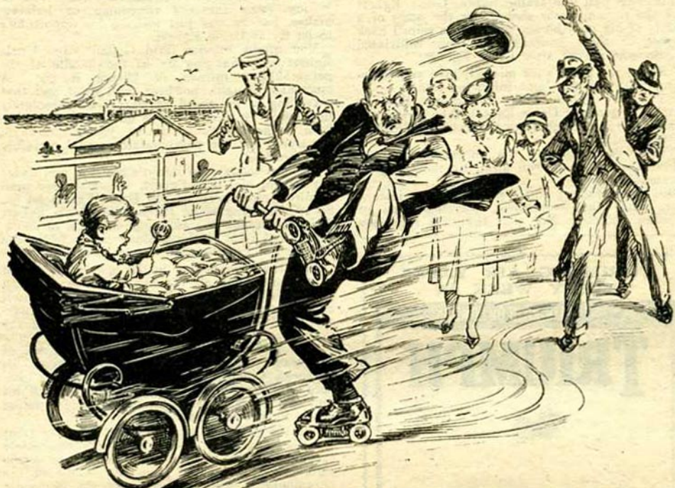
In a flash Uncle Egbert grabbed at the handle of the perambulator, and went whizzing along the promenade, propelling Abraham Roosevelt in front of him at breakneck speed. "Hey!" roared Bugs Moloney. "Stop, or I'll plug yuh!"

know how amazingly quickly panic does spread—and visitors and holiday-makers were scattering to give him a clear run through to wherever he happened to be heading for. The trouble was, poor Uncle Egbert hadn't the slightest idea where he was heading for. All he wanted to do—what he was wishing more passionately than anything in his life to be able to do—was to stop the wretched skates and restore Abraham Roosevelt to his distracted mother. But he couldn't, because all his attention was concentrated on preventing the perambulator from crashing into some seat, shelter or holiday-maker, and he daren't take his hands from the handle. Not that Abraham Roosevelt was worrying.