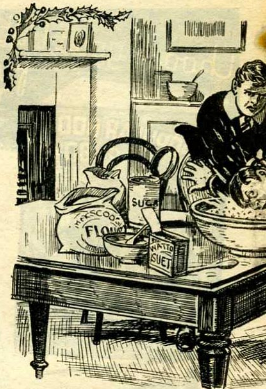
"Oooogh!" gurgled Baggy wildly as Blake Splash! Baggy's face

after Tom Merry found out that I had them! What was he doing up in the night?"