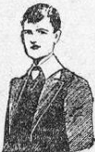
S. Q. I. FIELD