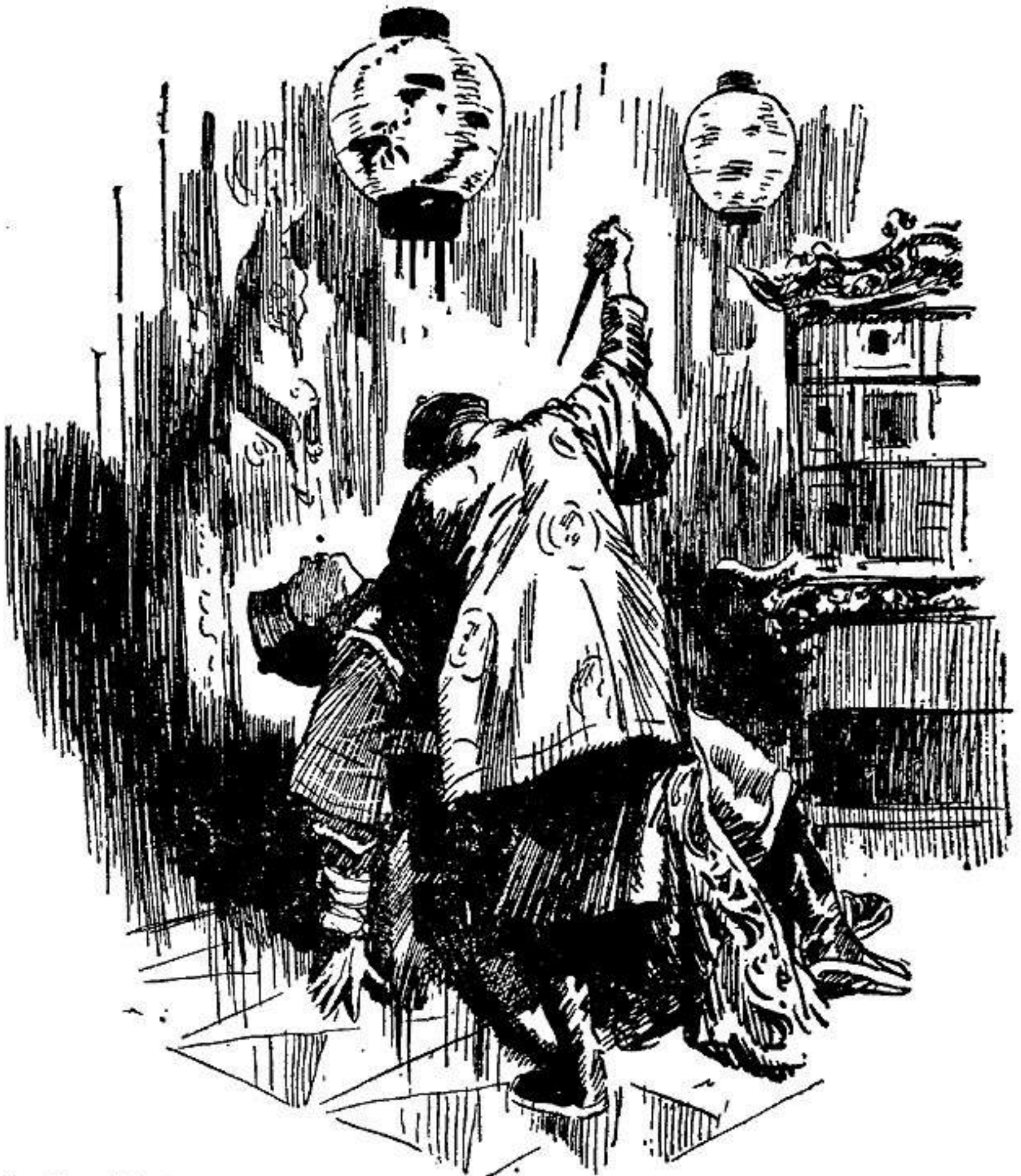
Crawling at the feet of the Mandarin Tang Wang, O No made a sudden spring, like a tiger, and a blade flashed out from under his robe!

The steady tramp came on; the figure of a Chinese soldier loomed in the darkness. Evidently the man was a sentry going his rounds, and he had heard something, and was watchful and suspicious. He peered closely into the shadows of the wall as he came along.