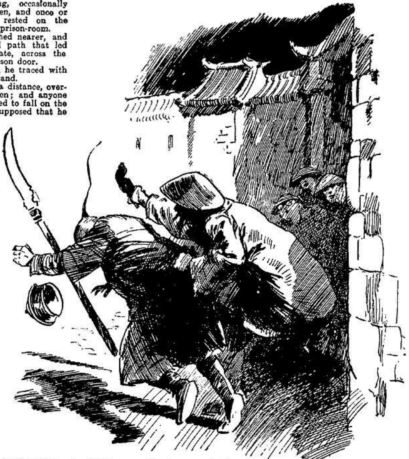
As the sentry approached the crouching figures under the wall, Ferrers Locke sprang upon him, and the heavy butt of his revolver crashed down on the man's head!

Clearly, unmistakably, the man had traced the word "HOPE," letter after letter, under their eyes; and they knew that he had seen them at the window. It could not be other than a message to them; and it could only come from Ferrers Locke.