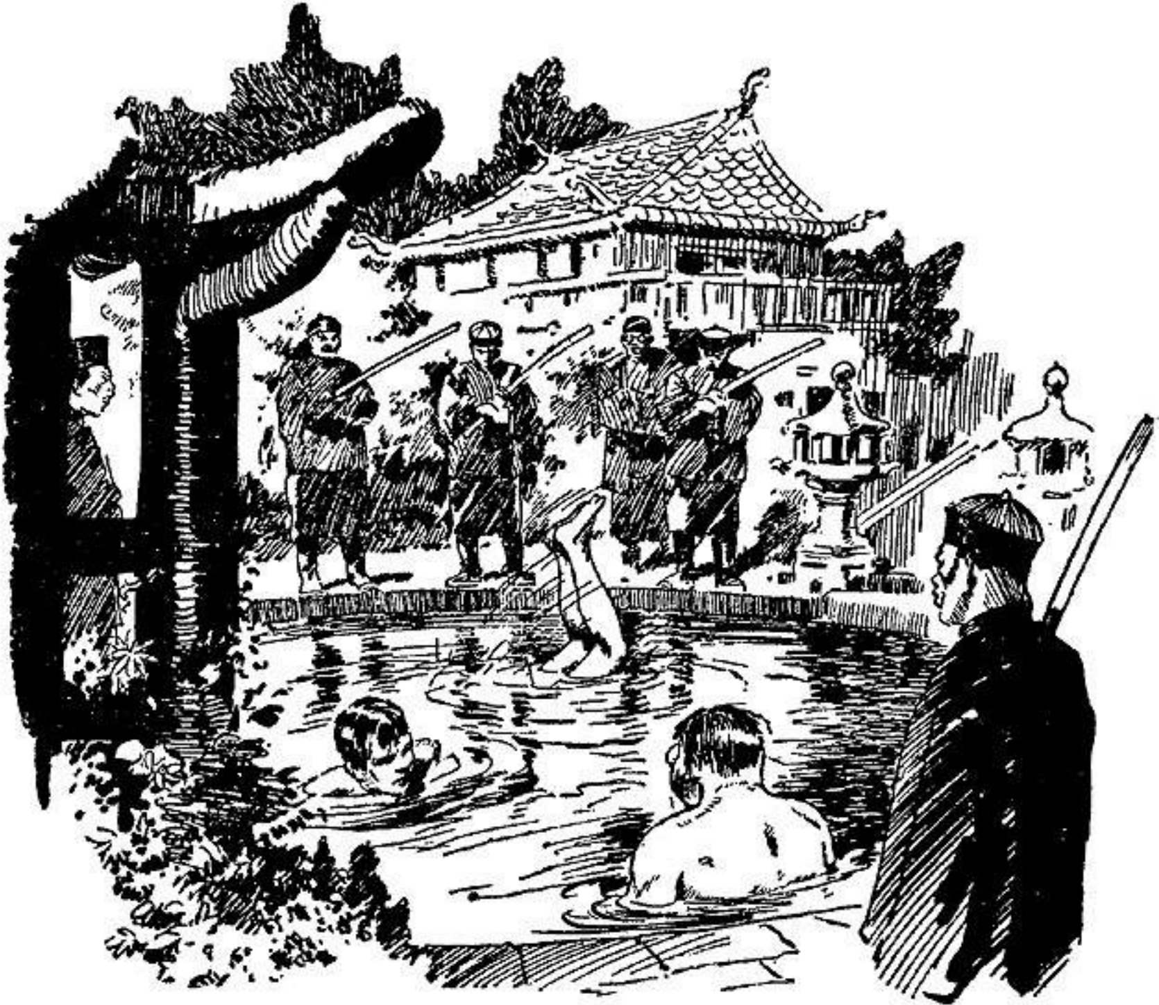
Harry Wharton, Bob Cherry, and Billy Bunter plunged into the little pool, while six soldiers with drawn swords watched them, with orders to cut off their ears if the juniors tried to escape!

Indeed, it seemed to Wharton that, in his silken coats and petticoats, of more hues than Joseph's celebrated coat, Mr. O No had just stepped off a jar, or a Chinese tea-chest. He had rather the look of a gorgeous butterfly fluttering in the doorway—though rather a substantial butterfly.