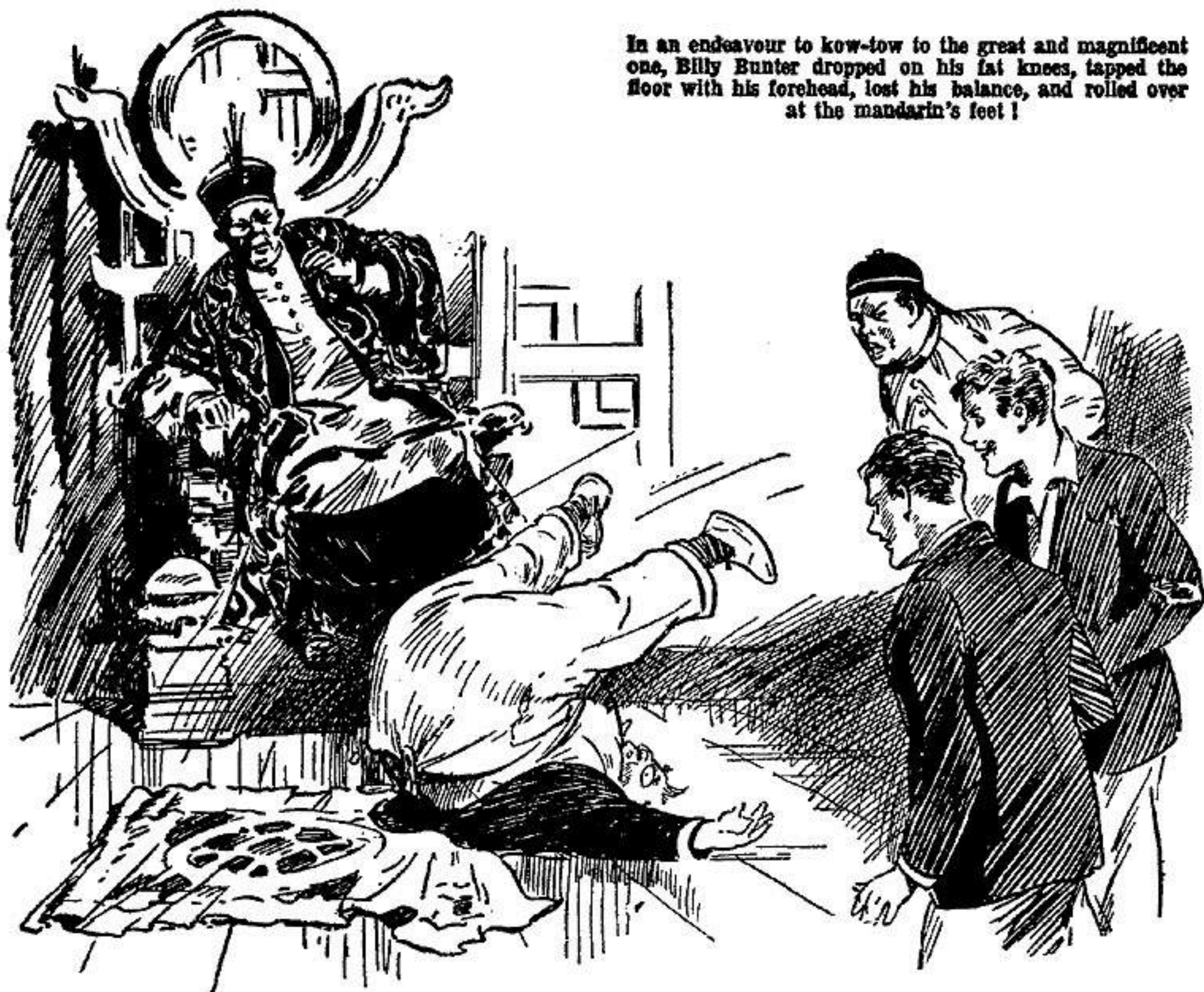
In an endeavour to kow-tow to the great and magnificent one, Billy Bunter dropped on his fat knees, tapped the floor with his forehead, lost his balance, and rolled over at the mandarin's feet!

Wang. "It is because I desire him to come that you are here."