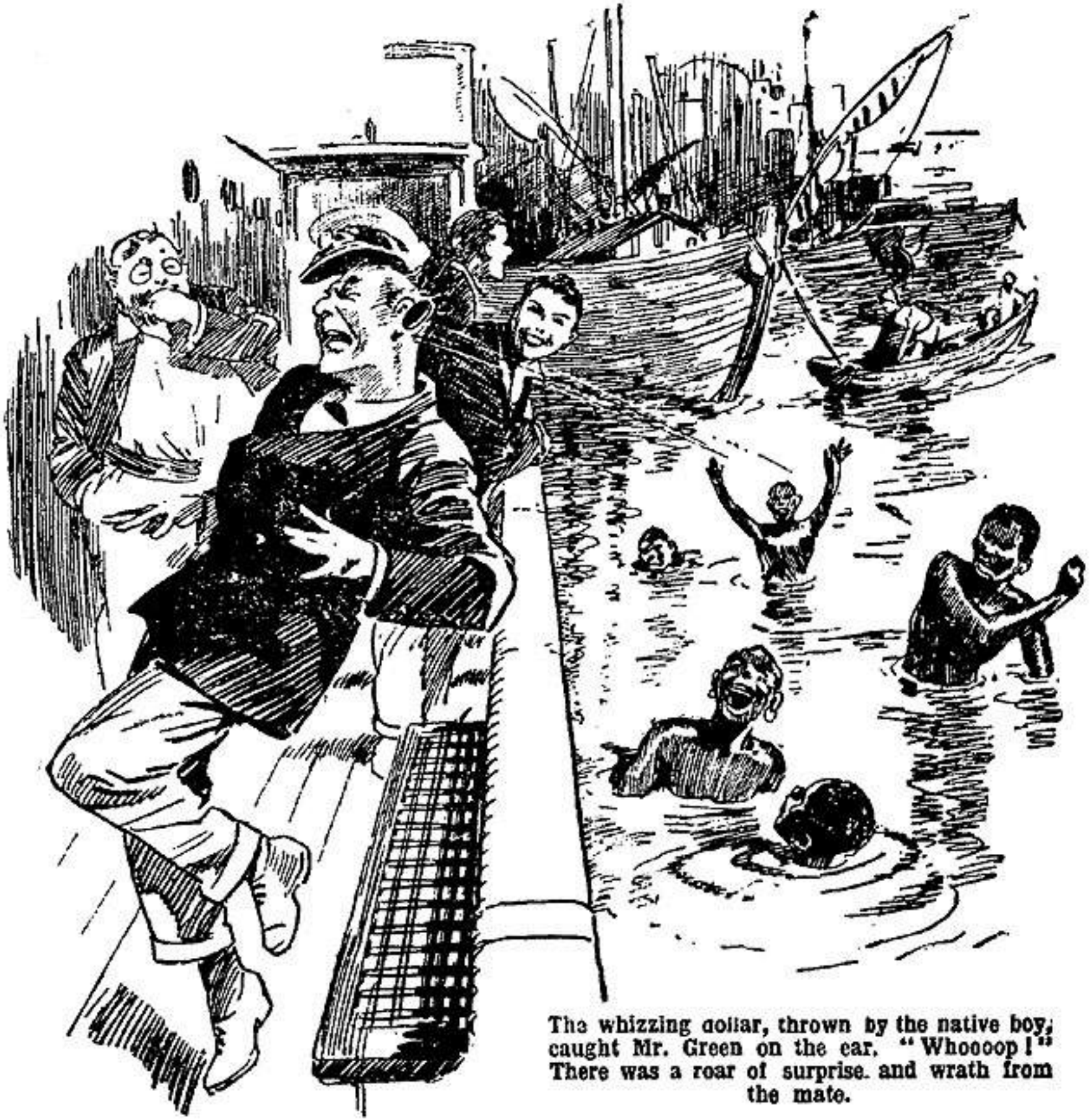
The whizzing dollar, thrown by the native boy, caught Mr. Green on the ear. "Whoooop!" There was a roar of surprise and wrath from the mate.

"Never mind that! It is possible that it was the man, and I shall leave word with the Port Said police," said Locke. And with that the matter