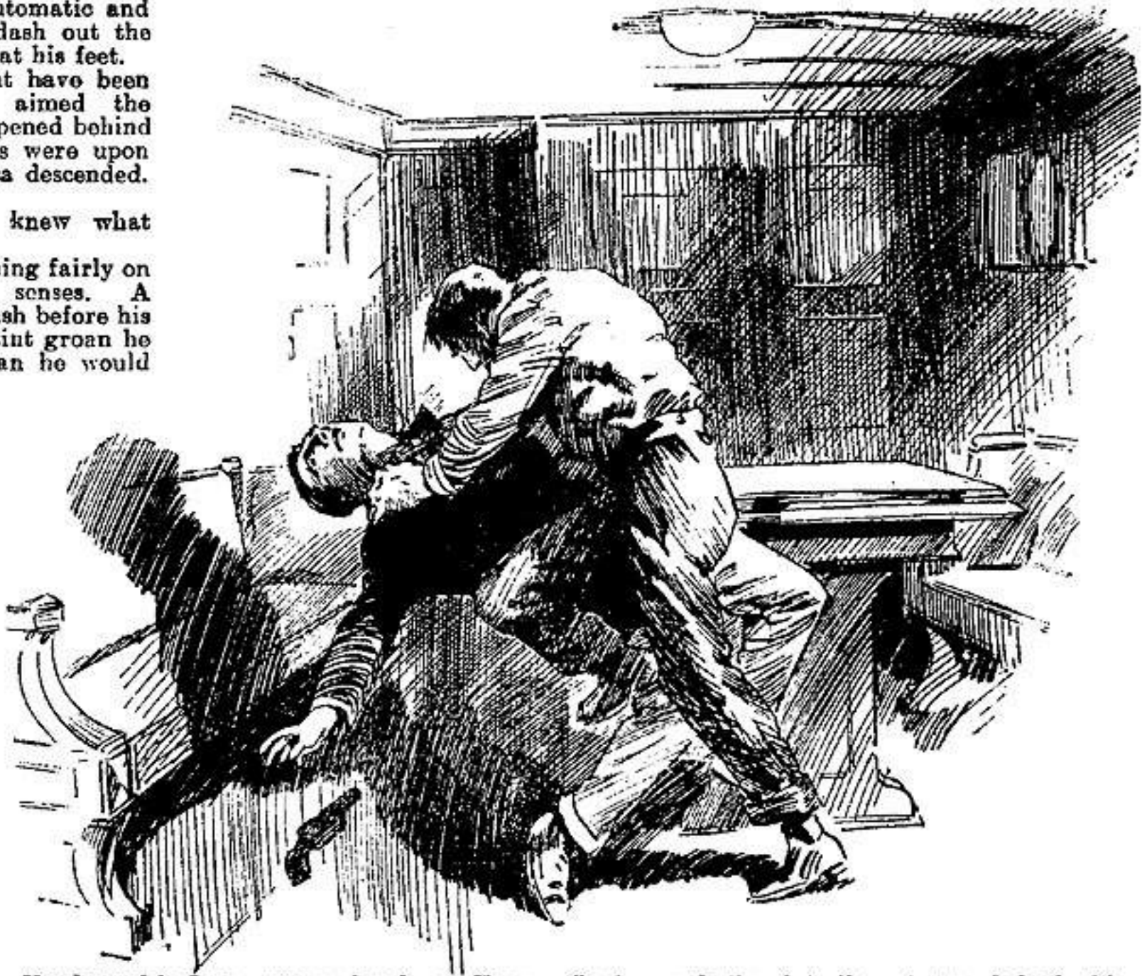
Vanderpeck's fierce grasp closed on Ferrers Locke, and the detective staggered back, his automatic dropping from his hand!

"Get the scoundrel away from here and got the irons on him!" said Ferrers Locke.