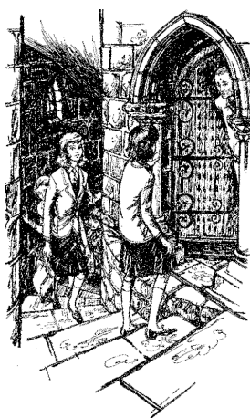
The haggard face of the convict peered out

bleached, and full of great cracks and holes by exposure to the weather. Babs stepped into the tower, coughing a little at the dusty and acrid smell which assailed her nostrils, and mounting a flight of crumbling, stone steps to her left.