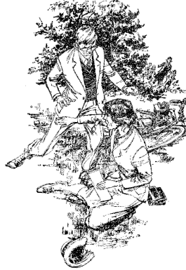
'Look! Miss Bullivant's being attacked!'