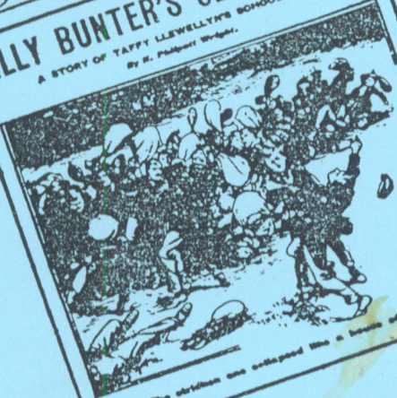
The children are celebrating the success of some...