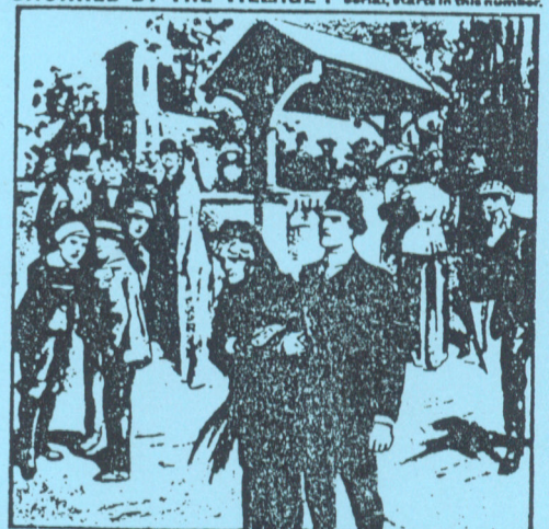
Shunned by the village... (Small text at the bottom of the illustration)