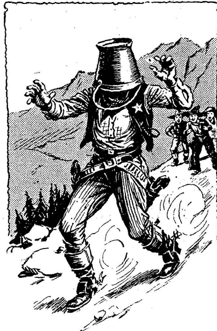
Bonneted by the water-bucket, the marshal of Bullwhacker staggered wildly away, leaving Dan, Kid, and Red roaring with laughter. But they didn't know to what lengths Hardfist Hall would go to get his vengeance on them!

Leaving the rotted pick where it lay, Kid searched along the cavern. He was accustomed to the gloom now; the twilight did not trouble his keen eyes. He gave a sudden