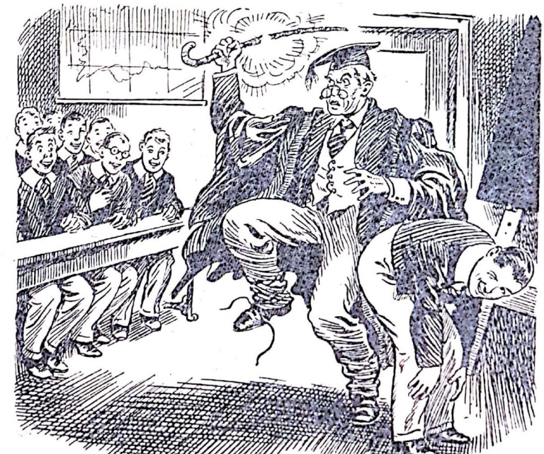
Will Hay put his beef into that swipe: he wanted to teach young Jerry Smart a lesson. But Will nearly turned a double somersault when the specially-repaired cane exploded in his hand, giving him the shock of his life.

Smiling sweetly, Will looked up and peered over his nose-glasses at the crafty face of Reggie Pyke.