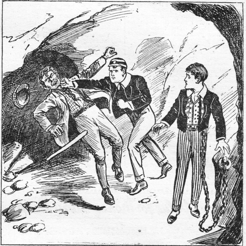
A drive straight from the shoulder caught the ruffian upon the chin, and he staggered back. Erroll was upon him the next moment. (See chapter 4.)

"It's a queer story. A good bit outside your experience, Morny! I was brought up by that man—Gentleman Jim. We never lived long in one place. Sometimes we had plenty of money,