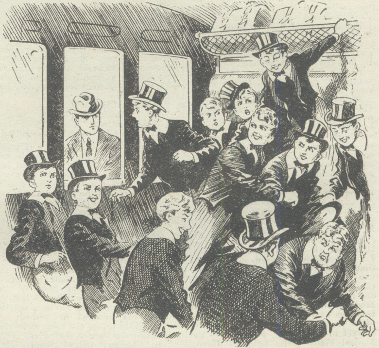
THE FACE JIMMY KNEW! A rather handsome young man stopped at the carriage door and looked in. "No room!" sang out the hilarious Rookwooders. Jimmy Silver caught sight of the man, and a startled exclamation broke from him. "You!" he stuttered. (See Chapter 3.)

But the Fistical Four did not answer that question. Lovell and Raby and Newcome were deeply doubtful, and Jimmy Silver had his head out of the window, watching.