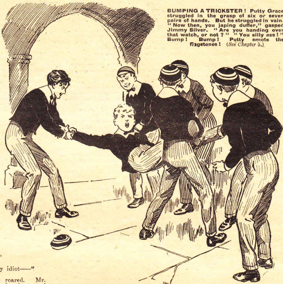
BUMPING A TRICKSTER! Putty Grace struggled in the grasp of six or seven pairs of hands. But he struggled in vain. "Now then, you japing duffer," gasped Jimmy Silver. "Are you handing over that watch, or not?" "You silly ass!" Bump! Bump! Putty smote the fistones! (See Chapter 5.)

Peele gave Cuthbert Gower a very curious look. Gower scowled at him in response.