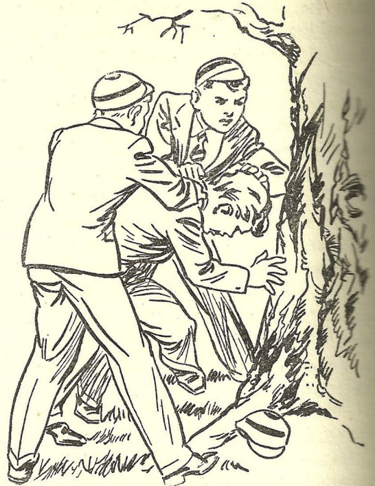
The fattest head at Felgate tapped on the trunk

Perkinson resumed his moody, angry pacing and angry reflections. The more he thought of that interview in the captain’s study, the fiercer his temper grew. Like the ancient prophet, he was not only angry, but felt that he did well to be angry. He was sorry now that he hadn’t let out at Langdale. Who, after all, was Langdale, to turn down the best winger at Felgate, and put a footling foozler in his place? What sort of a Sir Oracle did he esteem himself? Now, if Perk had been still standing in that study, he would not