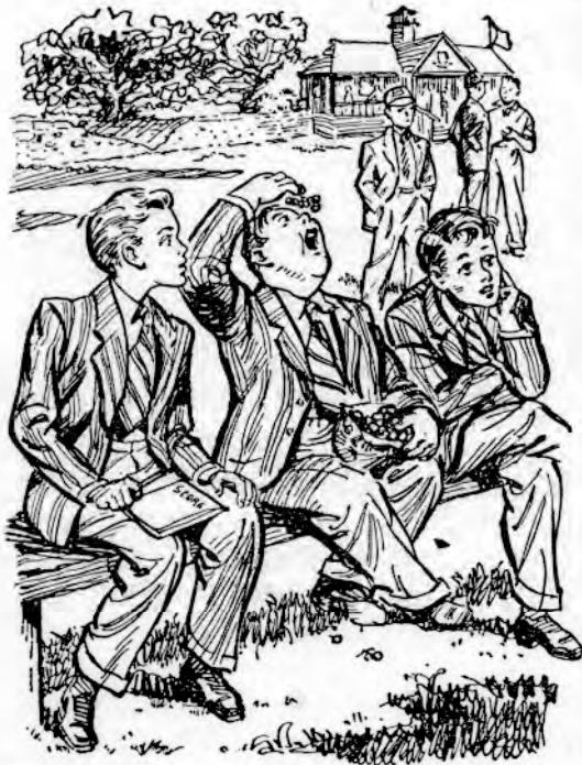
Skip, no doubt, was keen on cricket, but he was keener on cherries.

Practically all Felgate had turned up to watch the Lanchester match. Tom King, Dick Warren and Skip Ruggles, the three chums of Study Four in the Fourth, were of course there. Tom King and Dick Warren eyed Perkinson very curiously. Skip, for the moment, did not. Skip was eyeing a bag of cherries as he disposed of them one by one. Skip, no doubt, was keen on