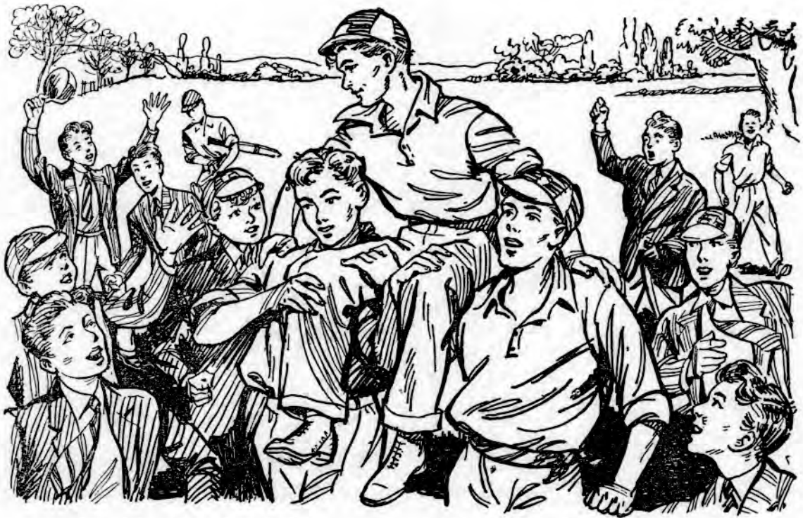
Langdale and another Sixth Form man carried him on their shoulders off the field.

chum. "This is worth a hundred lines, old man! Am I glad I nipped in at the Beak's window this morning!"