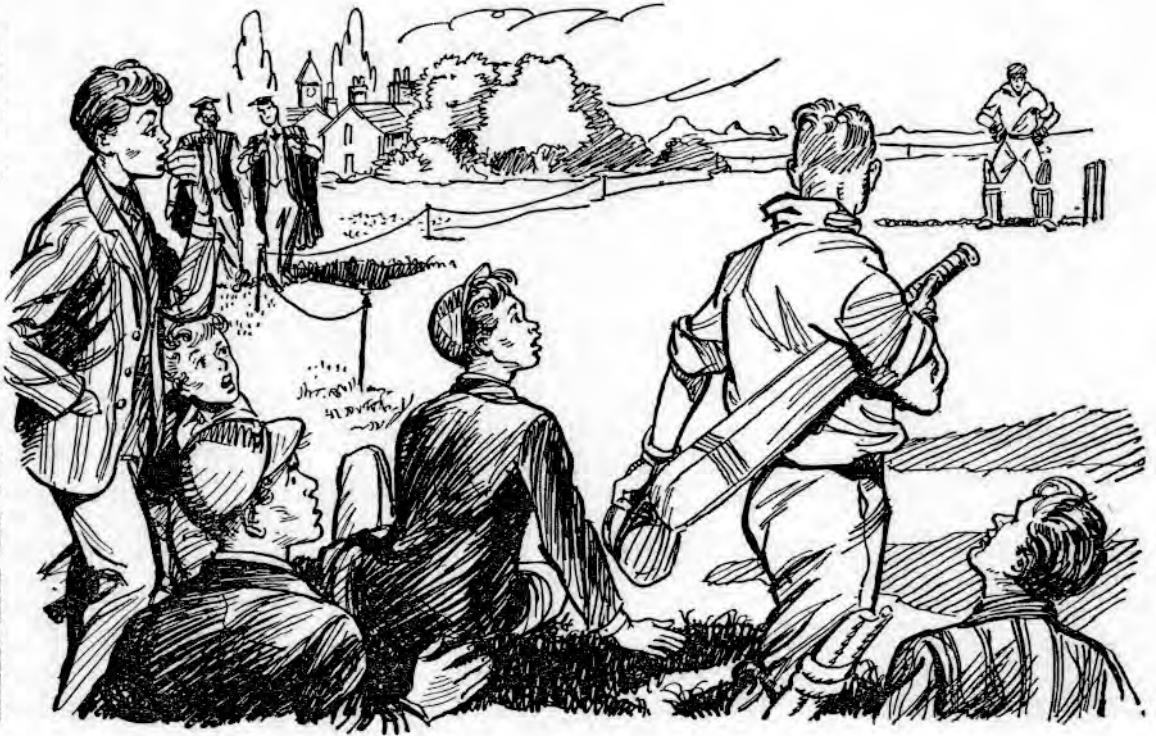
He tottered to his wicket.

“What about it?” he asked. “Look here, you’re keeping the field waiting. What on earth’s the matter with you?”