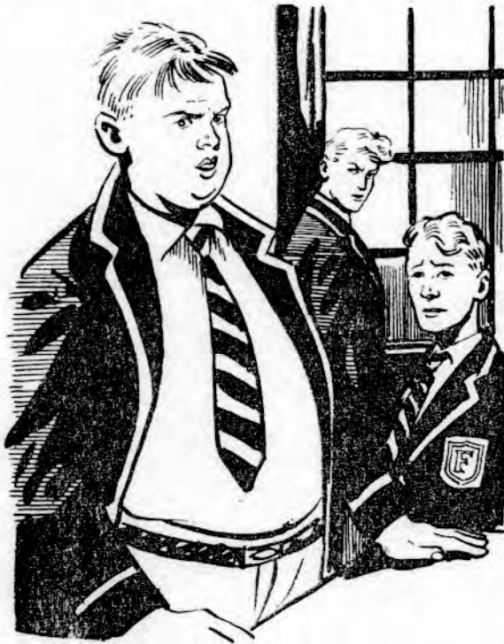
Skip wrinkled a fat brow in deep thought. "I say, suppose a fellow pinched his study key—"

The scene, of course, ended abruptly when a beak looked in. Tom King jumped up hurriedly; Selwyn, out of breath, continued to sprawl and gasp. Charne's grim eye pin-pointed Tom.