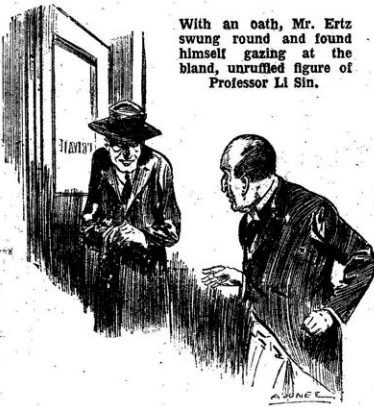
With an oath, Mr. Ertz swung round and found himself gazing at the bland, unruined figure of Professor Li Sin.

Save for a subtle air of refinement about