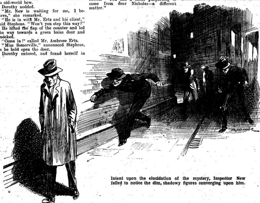
Intent upon the elucidation of the mystery, Inspector New failed to notice the dim, shadowy figures converging upon him.

"Keep back, you beast!" she cried, and her fingers closed on a heavy leaden paper-weight on the desk. A wild surge of exultation flooded her veins as she raised the