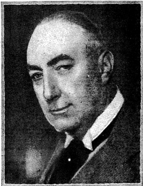
EDGAR WALLACE—MASTER OF MYSTERY.

There will be a rush for this issue of "The THRILLER." Order your copy NOW!