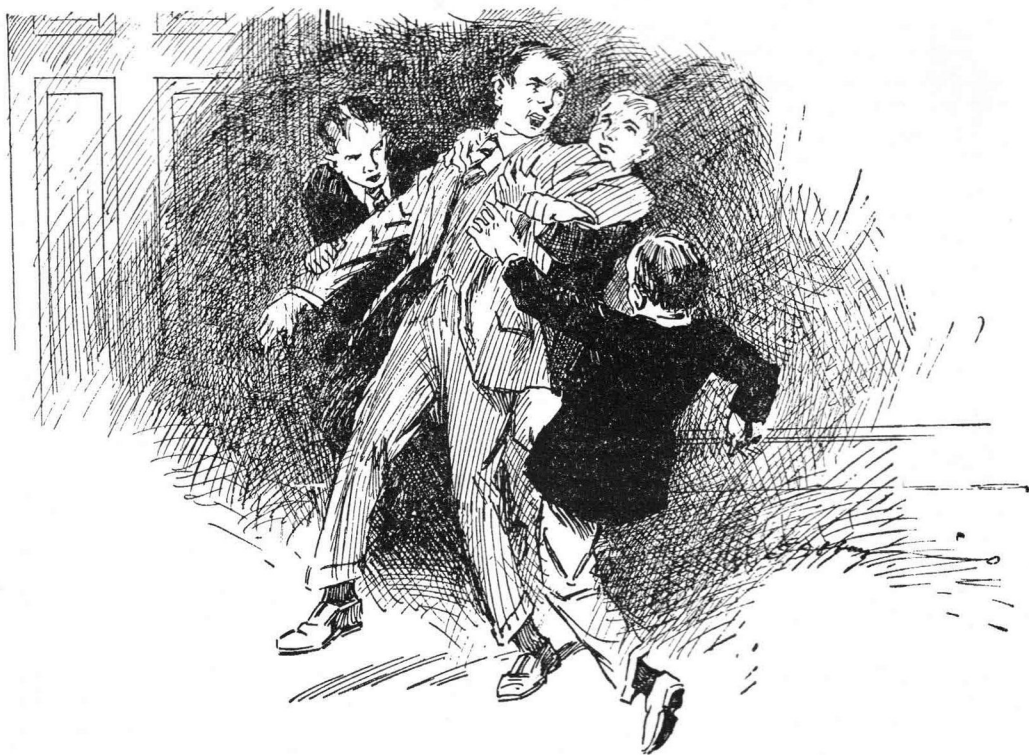
As that dim figure rushed in, three fellows leaped as if moved by the same springs.

It was the following day. The sun had gone down on Arthur Edward Lovell's wrath: and risen upon it again, finding it undiminished. His luckless experience as a shipper of studies had not daunted Lovell: rather it had made him more determined: it was one more item in the account against Carthew of the Sixth. He had had fairly to slave, to set the shipped study to rights after shipping it: and it was a bitter memory. At the end of his weary labours, Bulkeley had laid on the 'six' lightly: for which Lovell was duly grateful: still, "six" was six, especially when preceded by an earlier six as in Lovell's case. Altogether, Lovell was in an extremely disgruntled state of mind: and though the effect of both "sixes" had worn off the next day, he had not forgotten them. And he seemed to lay a good deal of the blame on his chums.