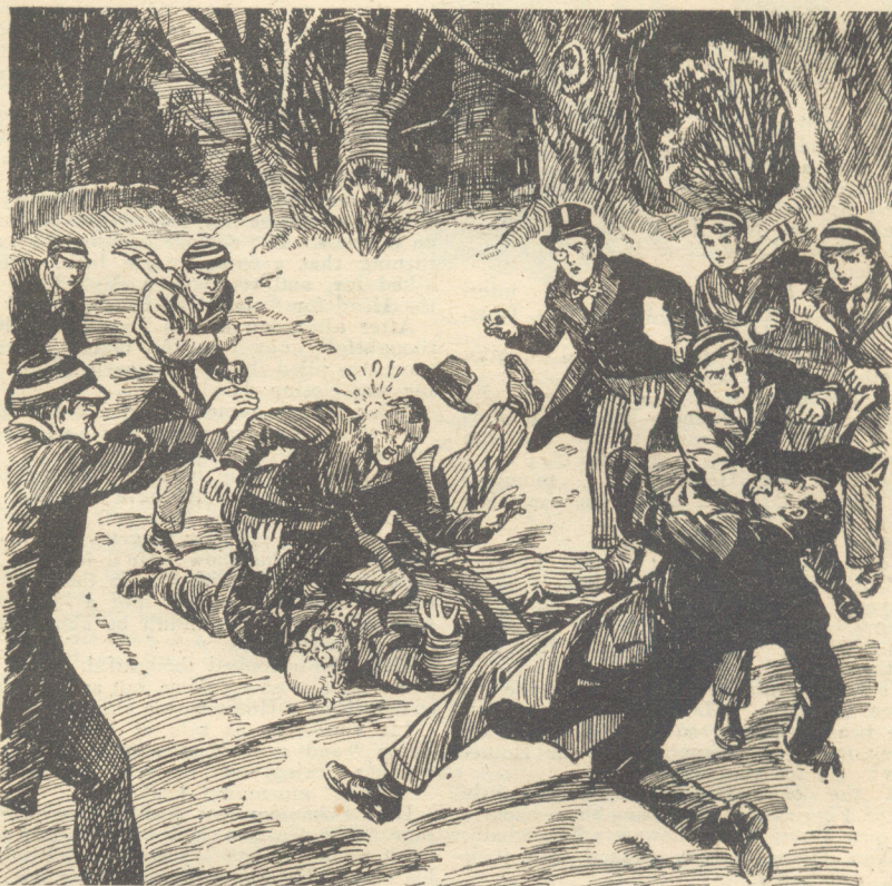
"Come on!" panted Tom Merry. The juniors did not hesitate a second. Without even thinking of the danger of tackling two desperate scoundrels, they rushed forward.

The Housemaster rubbed the snow away, glaring furiously. He seemed speechless with